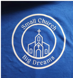
back of shirt