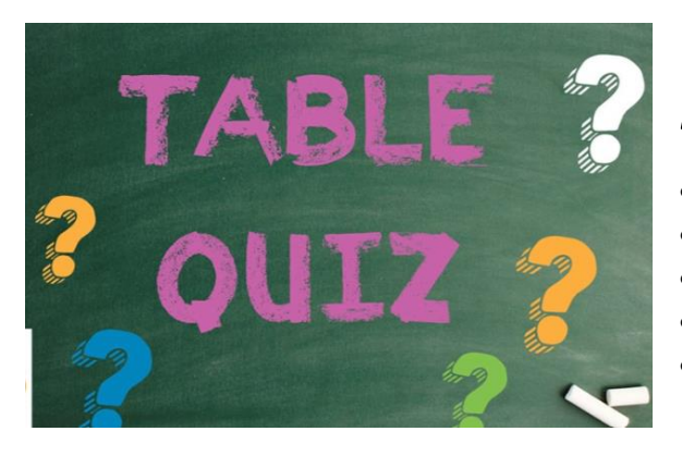
Table Quiz - Byrne's Bar Fri 6 March 9.00pm