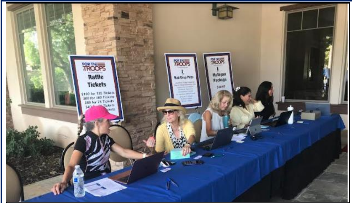
WVRWF members out to support "The Troops" members with registration for the annual golf tournament raising money "For the Troops", an organization that ships monthly care packages to our troops serving abroad.