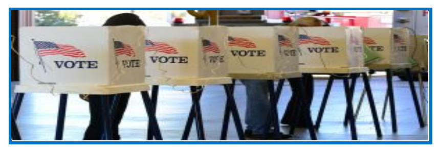
Lead the Future of Voting - be an Elections Worker!

If interested and would like to earn $22.37 per hour, please review the requirements on the job application and apply online today -be a part of history, join our team today! <u>~Click this line for JOB ANNOUNCEMENT~</u>