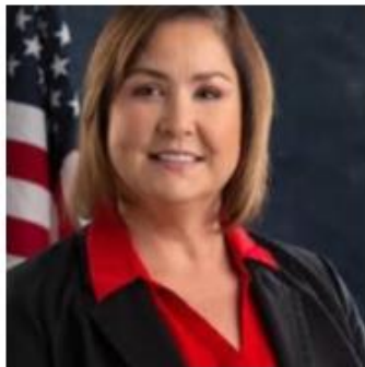
Denise Pedrow CA State Assembly