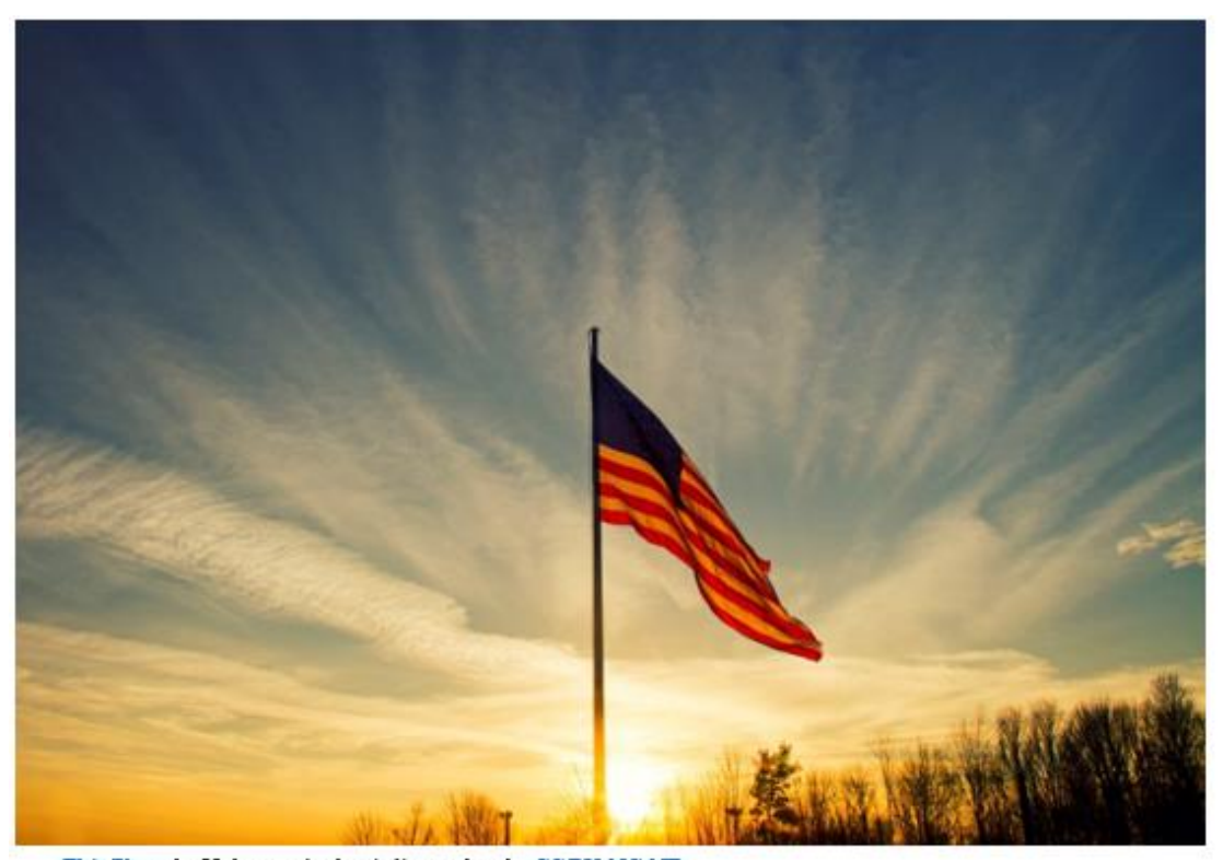
This Photo by Unknown Author is licensed under CCBY-NC-ND