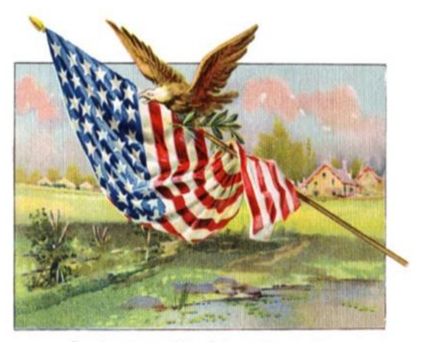
For mothers, wives and children, for home and country pride. Our flag will guard the freedom Of land and ocean wide.

Just fill out the application and we will reach out to let them know that you care! Membership applications are available on <a href="https://www.wvr.wvr.mv">www.wvr.wv</a> web page.