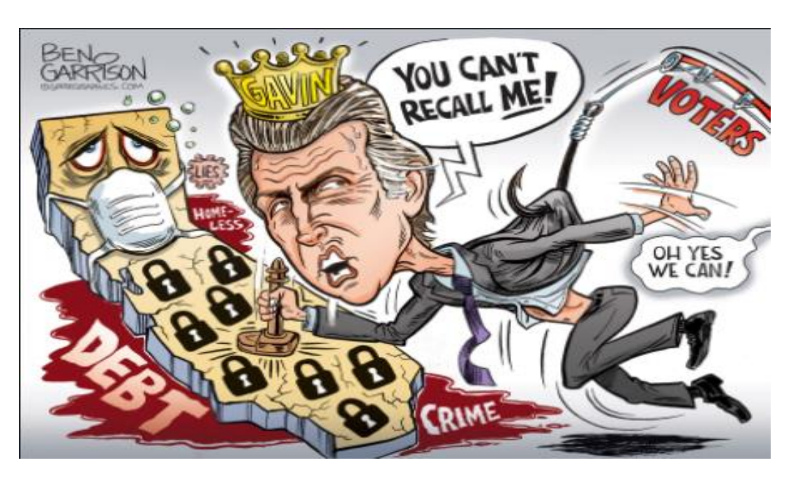
...He's Really Worried Now!

Total signatures needed to meet the requirements have now been qualified! <u>The recall vote is a certainty for late Fall 2021</u>