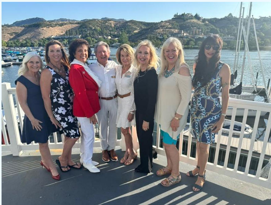
Coffee & Conservatives June 17, 2025