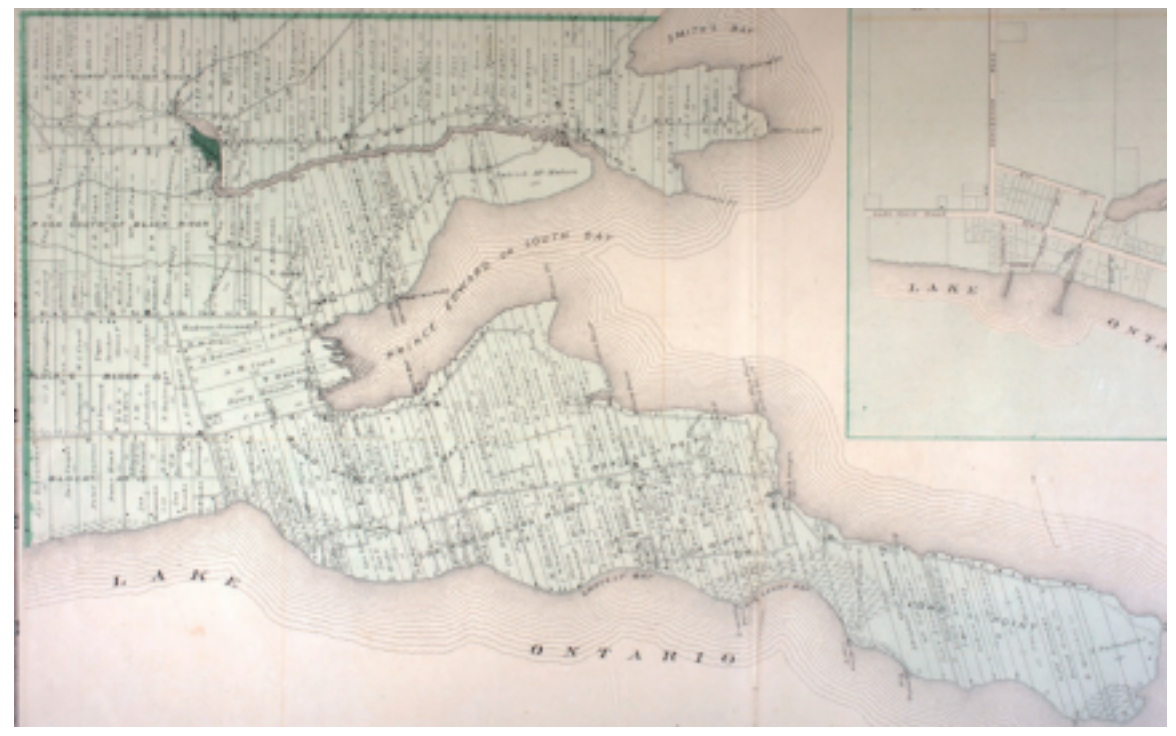
South Marysburgh Township.

Evident in the historical atlas mapping from the mid-19<sup>th</sup> century is a development pattern of long, narrow lots that front either on roads or on the shoreline (important before the development of roads). This survey pattern is uncommon outside of Quebec and appears to have been an attempt to offer what were the first wave of settlers in this part of Ontario an equitable share of frontage on the main access route. In Athol the predominant orientation of lots is north-south, with a few anomalies running east-west (e.g. on the north side of Soup Harbour) that respond to local wetlands. In South Marysburgh the lot pattern resembles that of neighbouring Athol until it becomes skewed to the northwest as a response to the curving shorelines on both sides of the peninsula. Development in both townships is concentrated along roads but there is also evidence of housing in the shallow bays along the south shore and around South Bay.