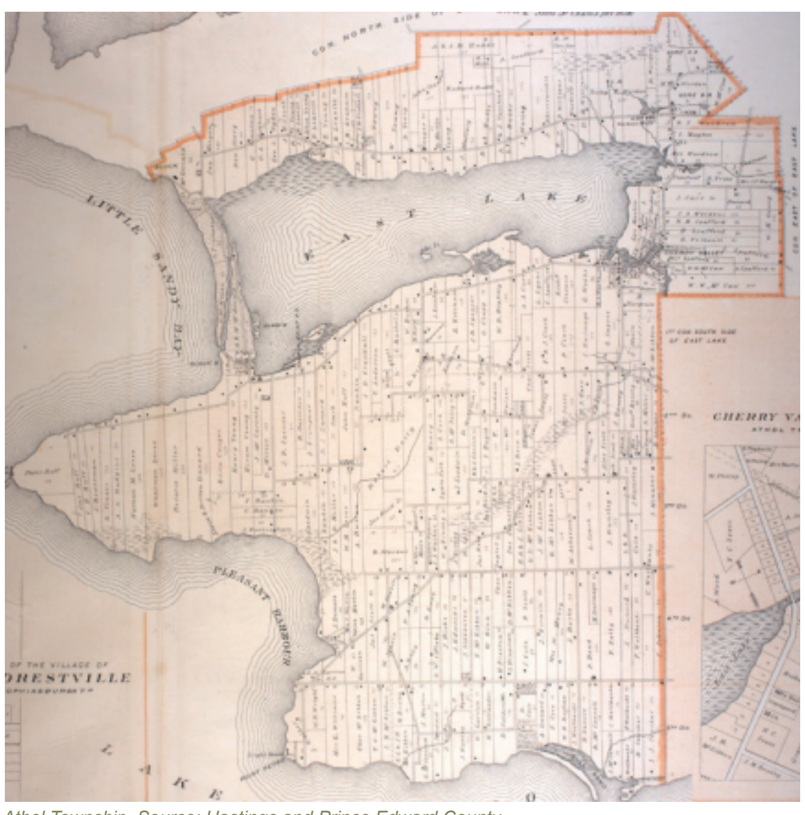
Athol Township.