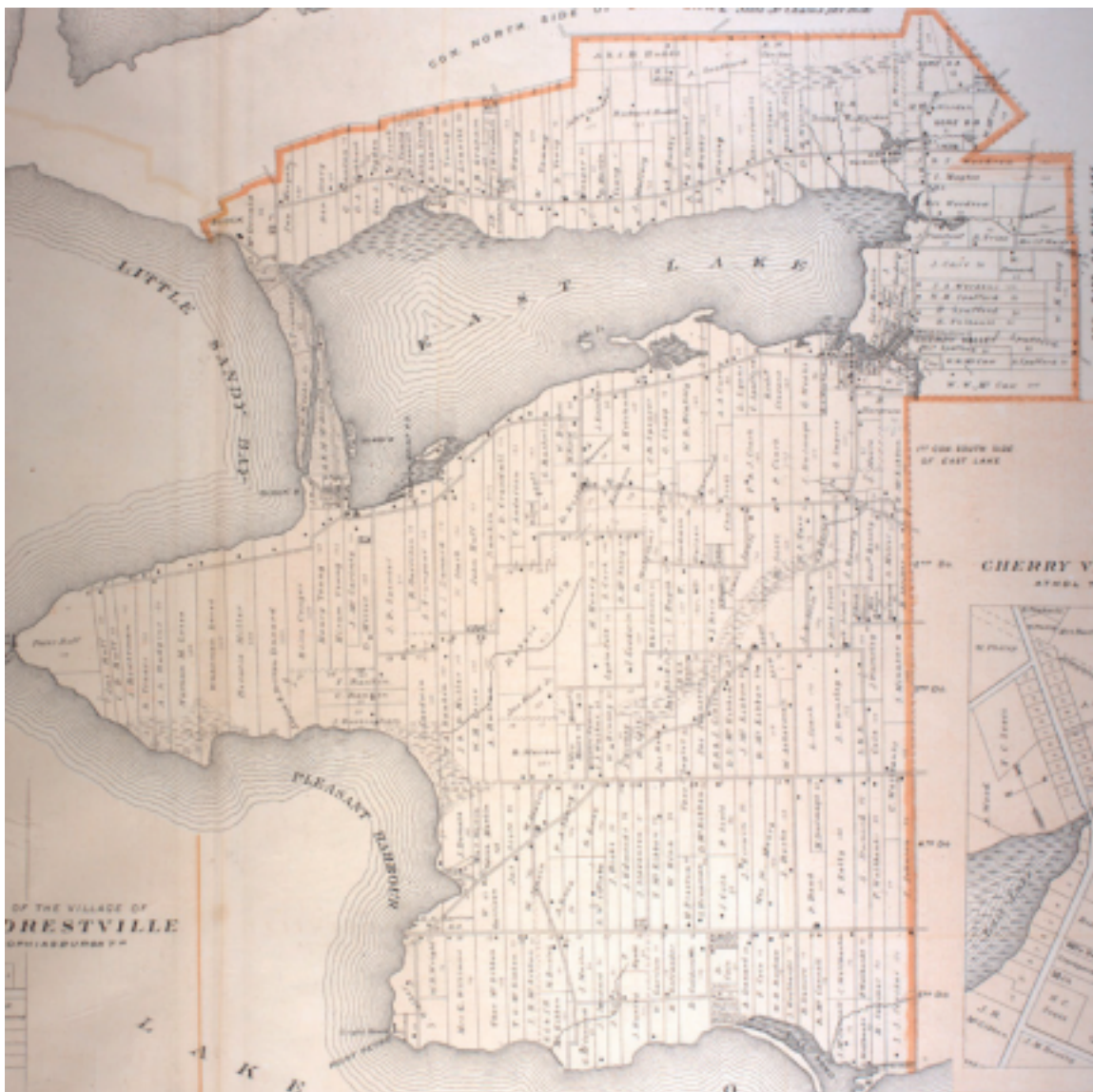
Athol Township.