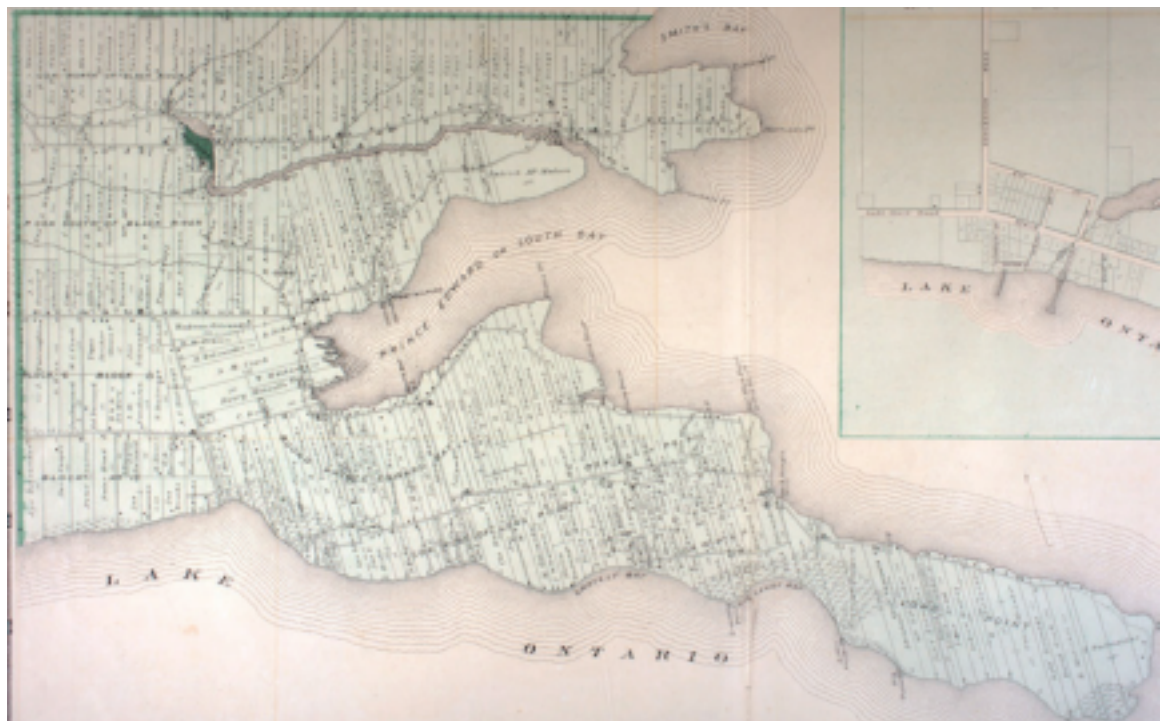
South Marysburgh Township.

Evident in the historical atlas mapping from the mid-19 th century is a development pattern of long, narrow lots that front either on roads or on the shoreline (important before the development of roads). This survey pattern is uncommon outside of Quebec and appears to have been an attempt to offer what were the first wave of settlers in this part of Ontario an equitable share of frontage on the main access route. In Athol the predominant orientation of lots is north-south, with a few anomalies running east-west (e.g. on the north side of Soup Harbour) that respond to local wetlands. In South Marysburgh the lot pattern resembles that of neighbouring Athol until it becomes skewed to the northwest as a response to the curving shorelines on both sides of the peninsula. Development in both townships is concentrated along roads but there is also evidence of housing in the shallow bays along the south shore and around South Bay.