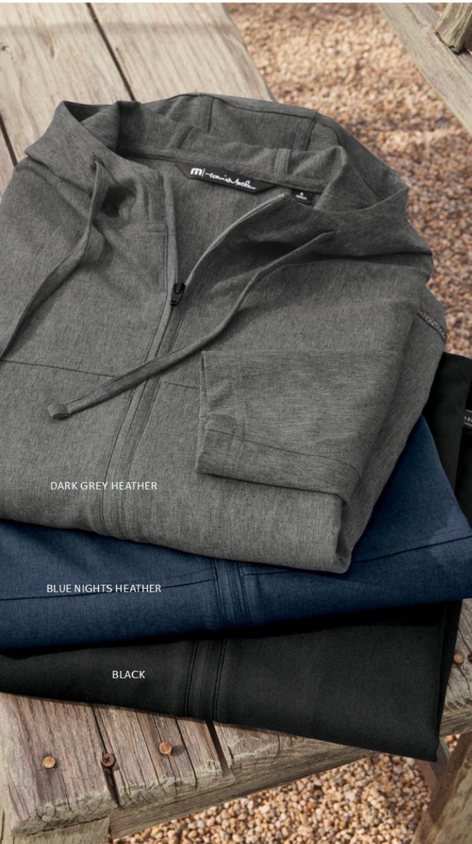
DARK GREY HEATHER