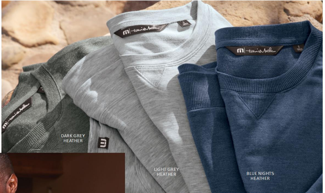
DARK GREY HEATHER