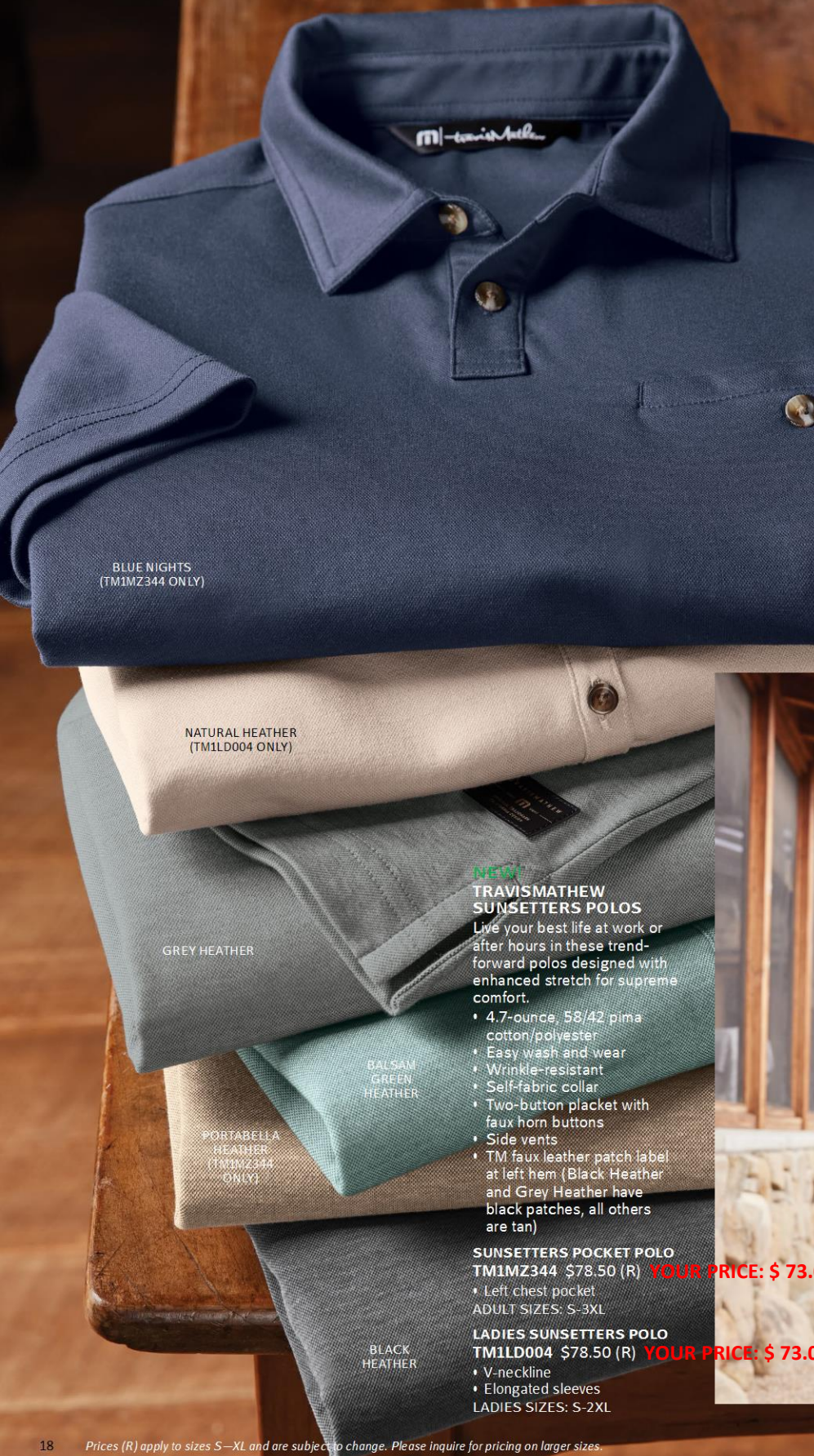
BLUE NIGHTS (TM1MZ344 ONLY)