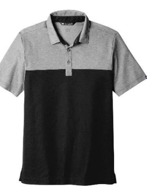
White/Quiet Shade Grey Heather