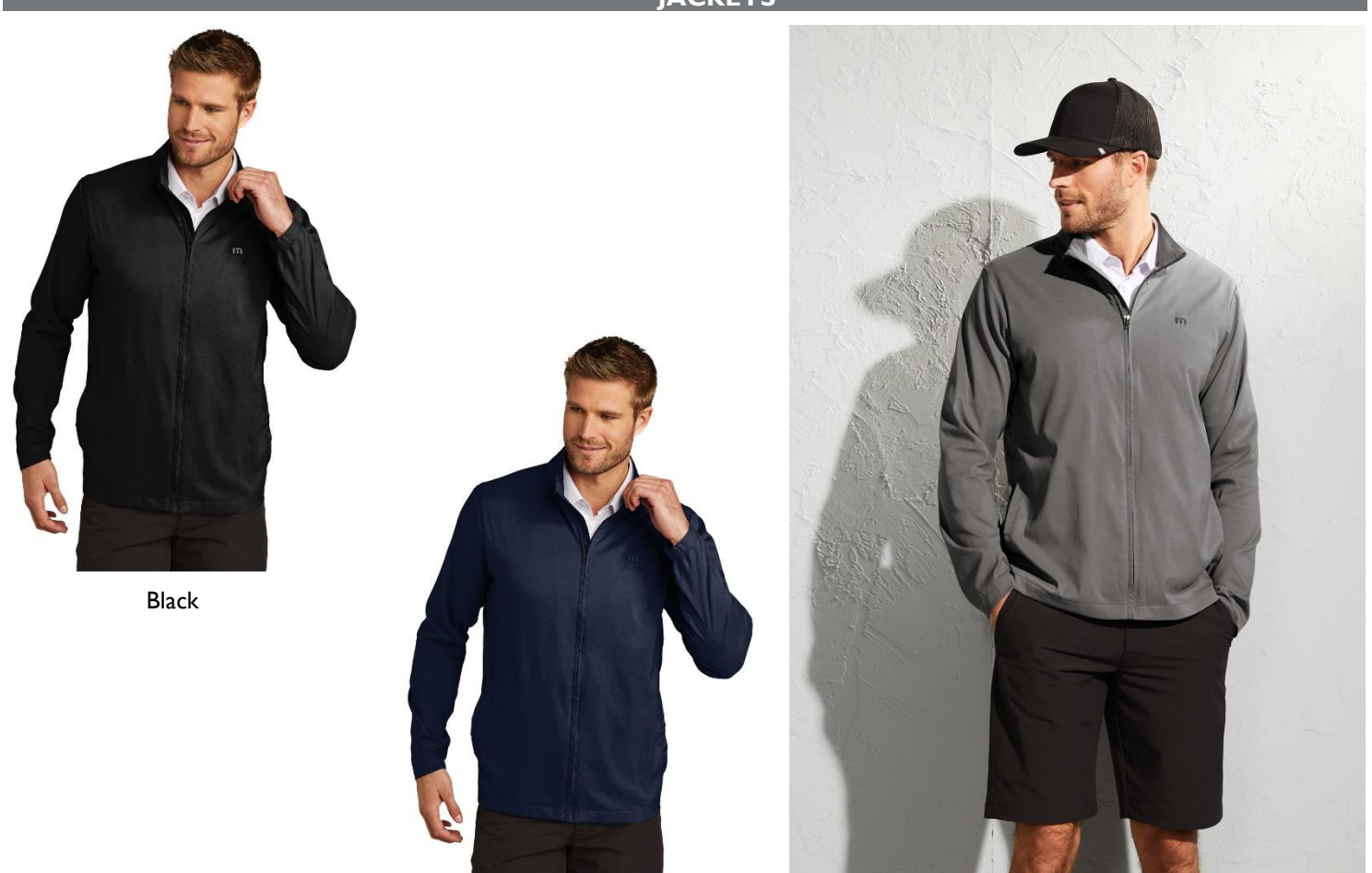
Vintage Indigo / Black