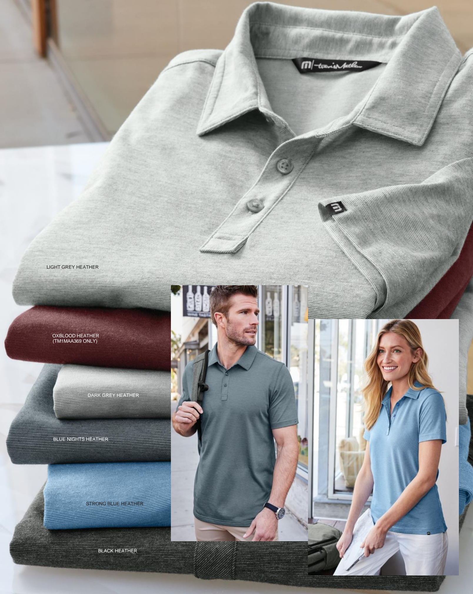
LIGHT GREY HEATHER