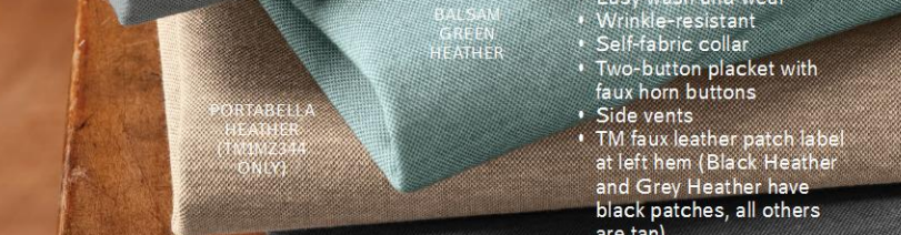
DALSAM GREEN HEATHER