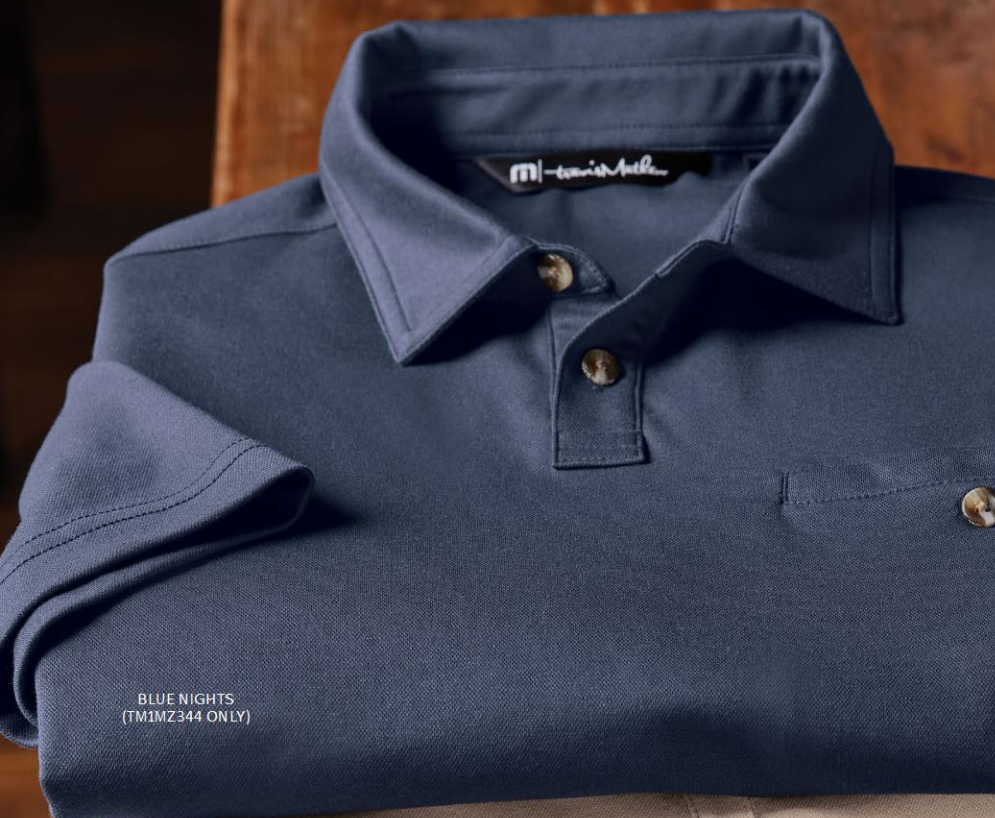
BLUE NIGHTS (TM1MZ344 ONLY)