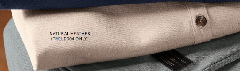
NATURAL HEATHER (TM1LD004 ONLY)