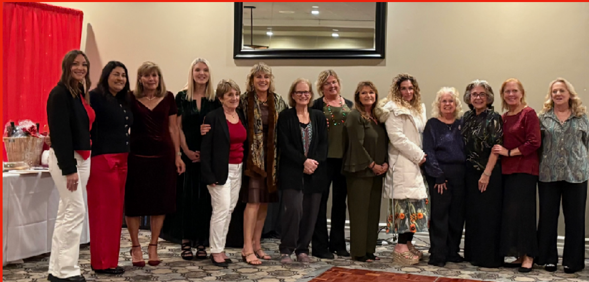
2026 Board of Directors and Other Officers