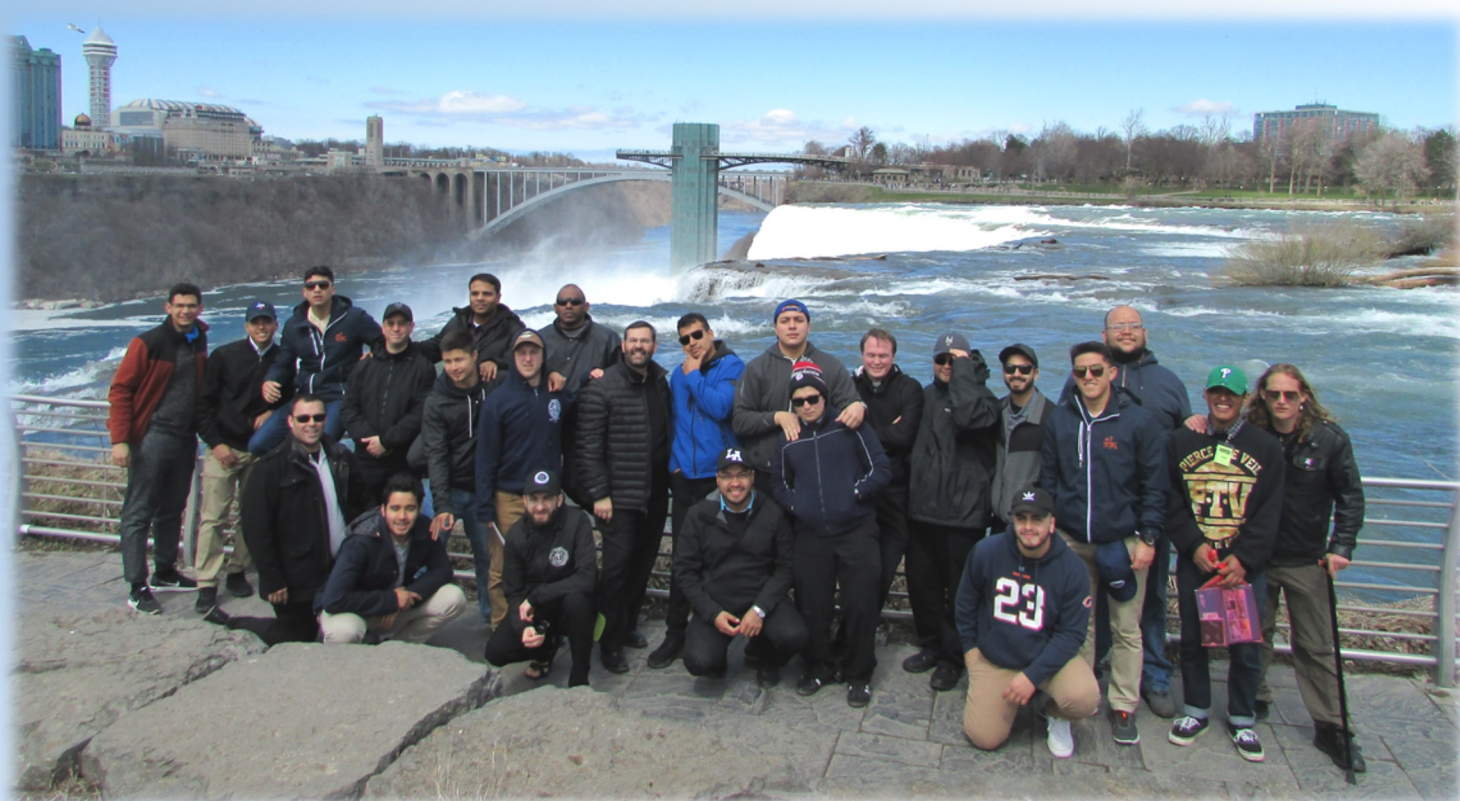
At Niagara Falls.