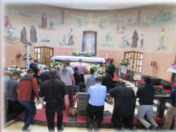
At National Shrine of St. Frances Xavier Cabrini