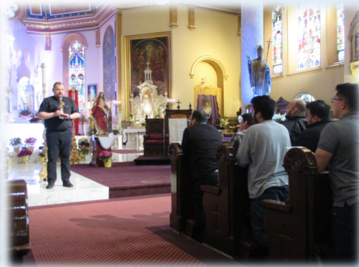
At St. Stanislaus in Buffalo, NY. Shrine of St. JP II