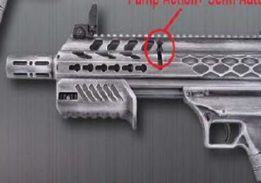
Pump Action+ Semi Auto