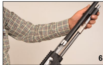
6. Remove the barrel