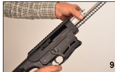
9. Remove the mechanism