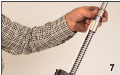
7. Remove the plunger