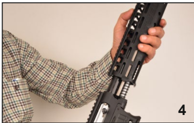
4. Remove the handle stock