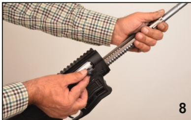
8. Pull the charging handle