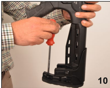
10. Remove the screw