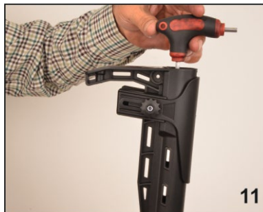
11. Opening the screw remove butt