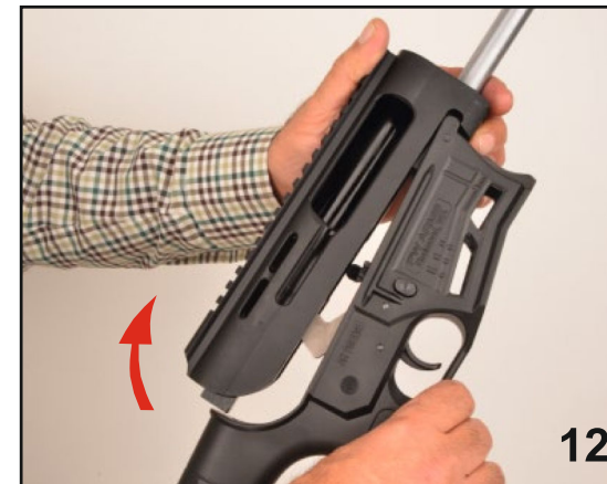
12. Seperate the receiver into two

IMPORTANT WARNING: BEFORE YOU START CLEANING YOUR SHOTGUN ALWAYS MAKE SURE IT IS UNLOADED AND POINTED IN A SAFE DIRECTION.