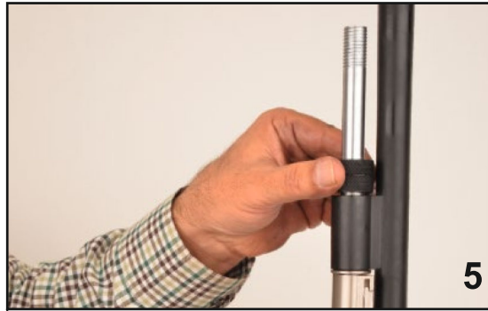
5. Remove the magazine cap