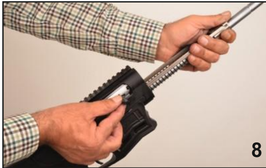
8. Pull the charging handle