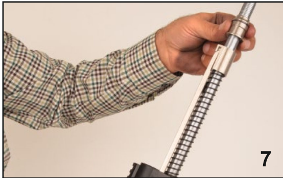
7. Remove the plunger