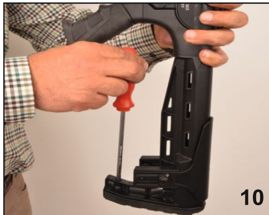
10. Remove the screw