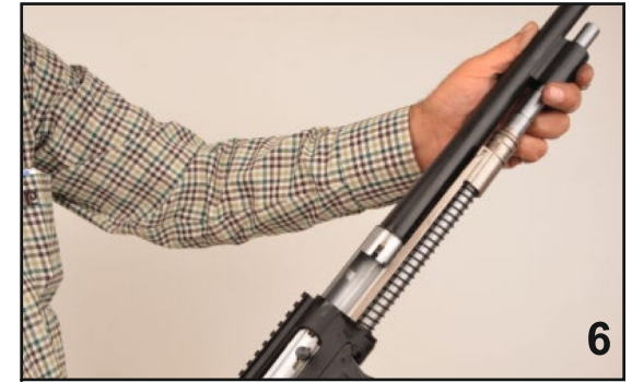
6. Remove the barrel