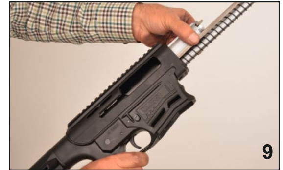
9. Remove the mechanism