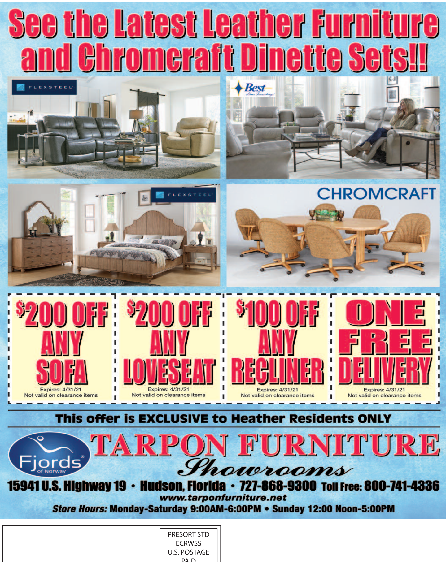
Page 16 • The Heather • April 2021