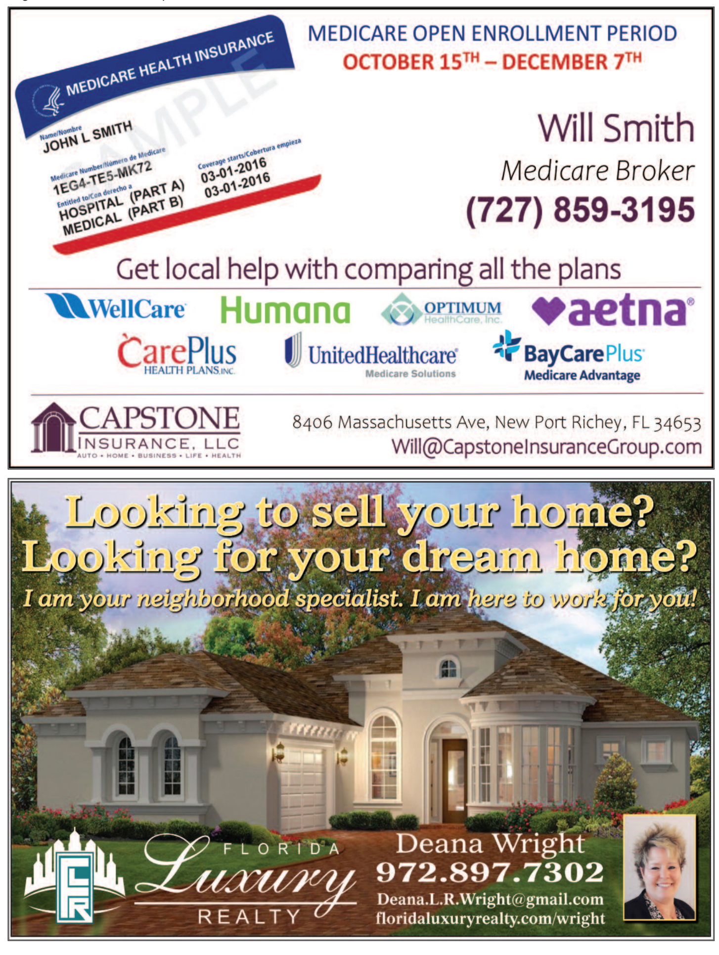
Page 14 • The Heather • April 2021