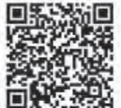
Hernando Emergency Management

Get Informed: Know the specific hazards that threaten your community (hurricanes, tornadoes, wildfires, etc.), and learn more about any assistance programs. Visit FloridaDisaster.org to learn if you are in an evacuation zone.