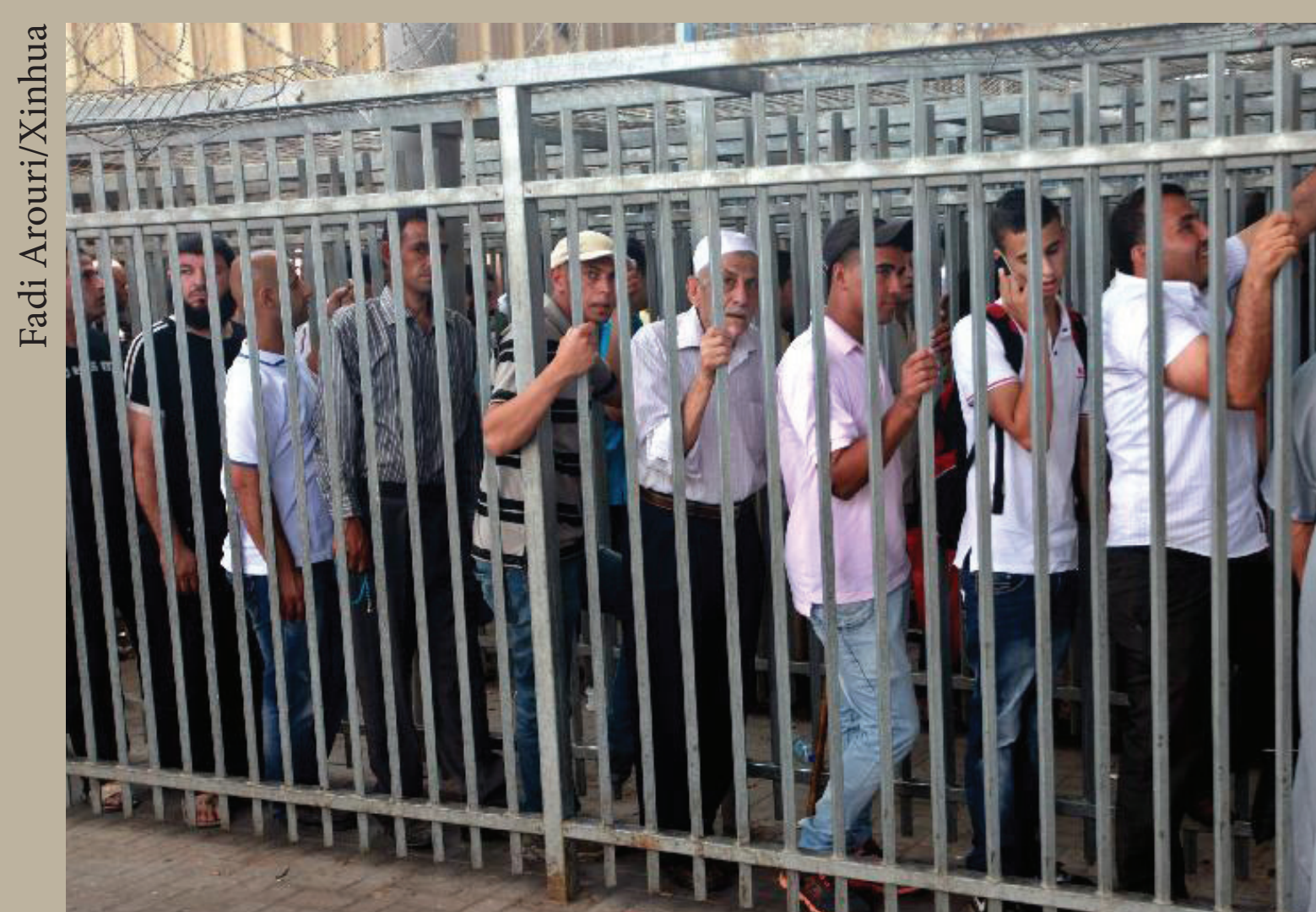
Palestinians wait to cross Qalandia checkpoint on their way to attend Ramadan Friday prayers in Jerusalem on August 3, 2012.

"Our Liberation Is Intertwined," An Interview with Linda Sarsour, On Antisemitism: Solidarity and the Struggle for Justice , p.93, 2017