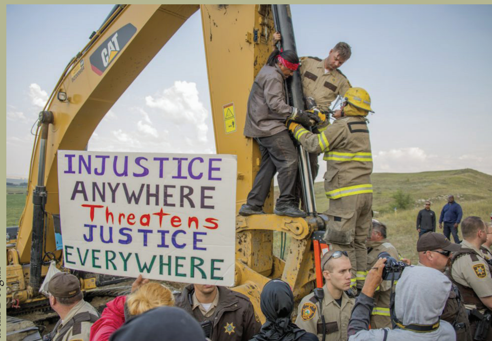
This quote by Martin Luther King, Jr. appears in support of the Standing Rock Sioux in a protest against the Dakota Access Pipeline, August 31st, 2016.

Like Jim Crow (and slavery), mass incarceration operates as a tightly networked system of laws, policies, customs, and institutions that operate collectively to ensure the subordinate status of a group defined largely by race.