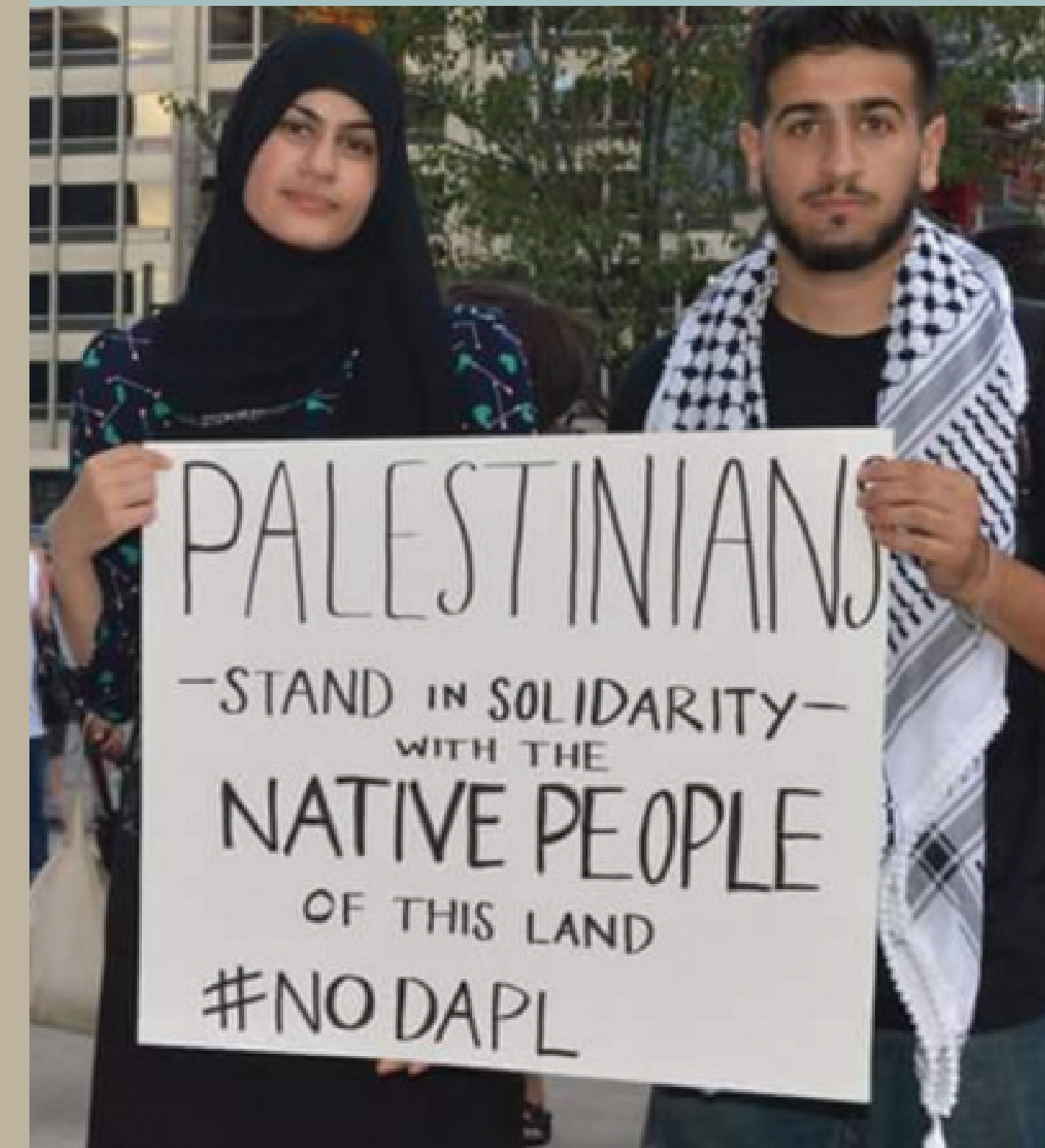
Friends of Sabeel North America (FOSNA) Solidarity Statement

Left: November 25, 2017. People of African descent and supporters protest against against the slavery and human rights that refugees face in Libya, in front of the Libyan embassy in Berlin, the event took place as other demonstrations were organized internationally.