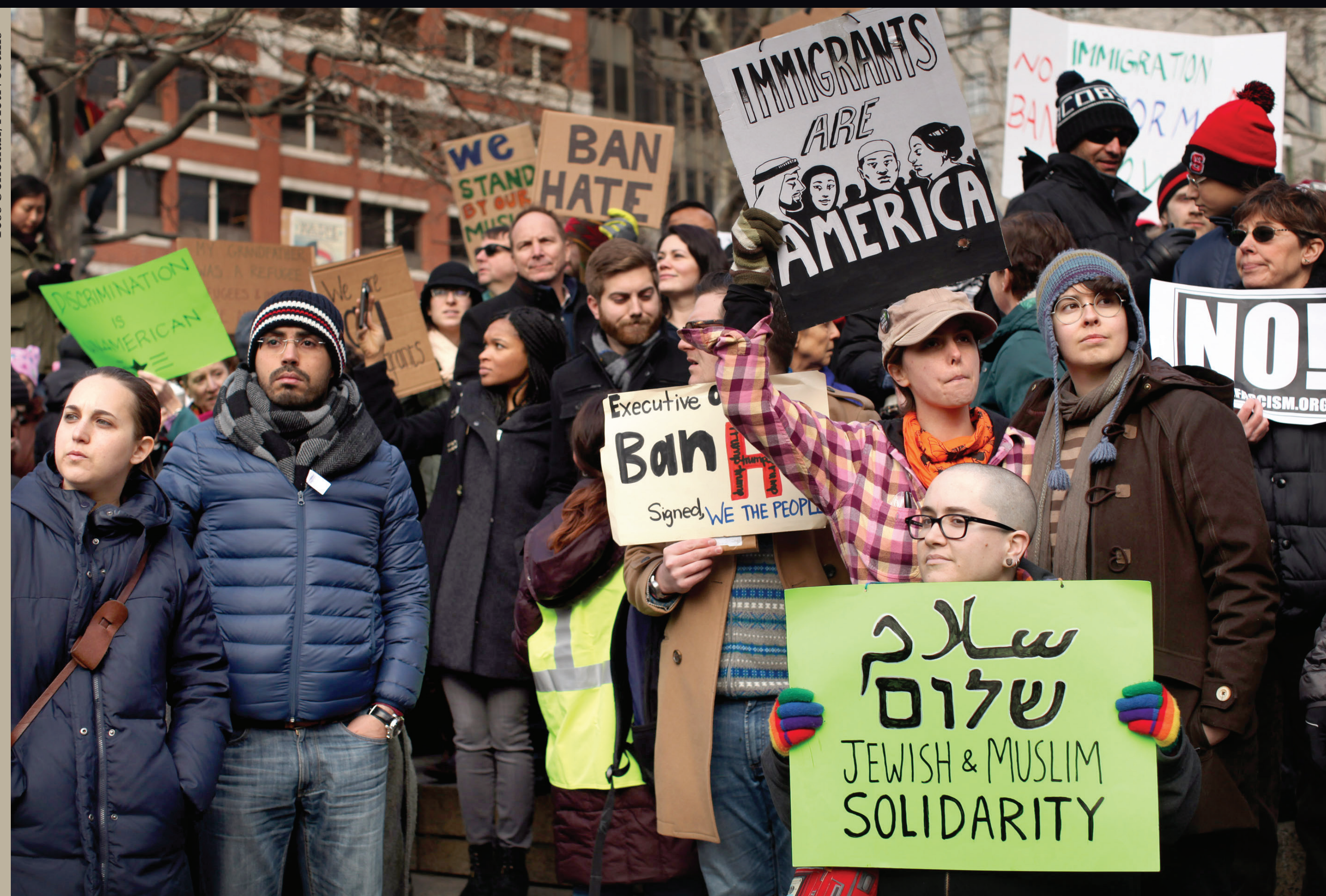
Above: Protesters gathered in Copley Square in Boston, MA, January 29, 2017, to demonstrate against President Trump's immigration order.