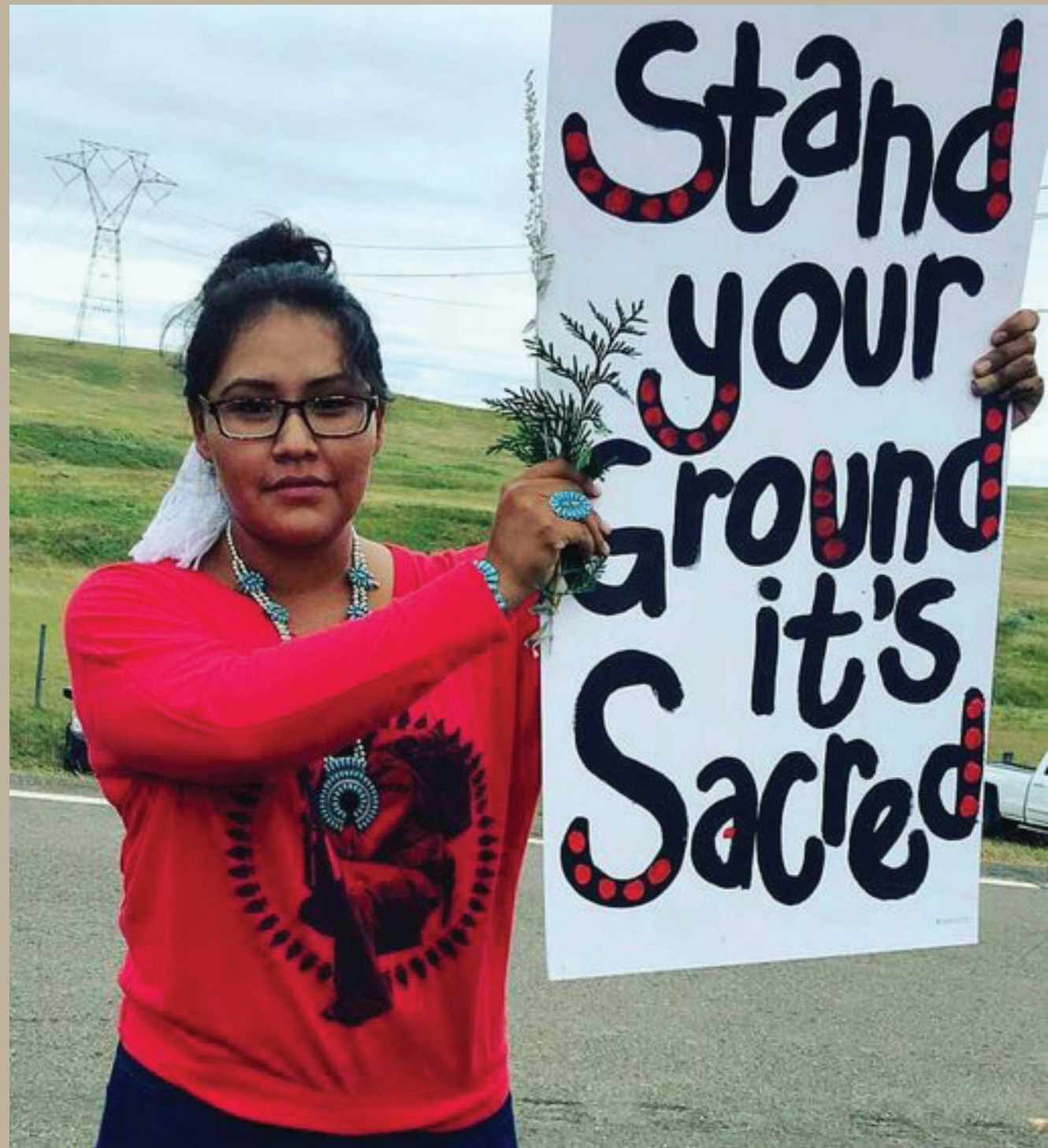
To stand one's ground acknowledges the right to defend one's beliefs or rights through acts of resistance and protest. Here, a protester at Standing Rock holds a sign which demonstrates the importance of their ancestral lands to the indigenous Dakota.