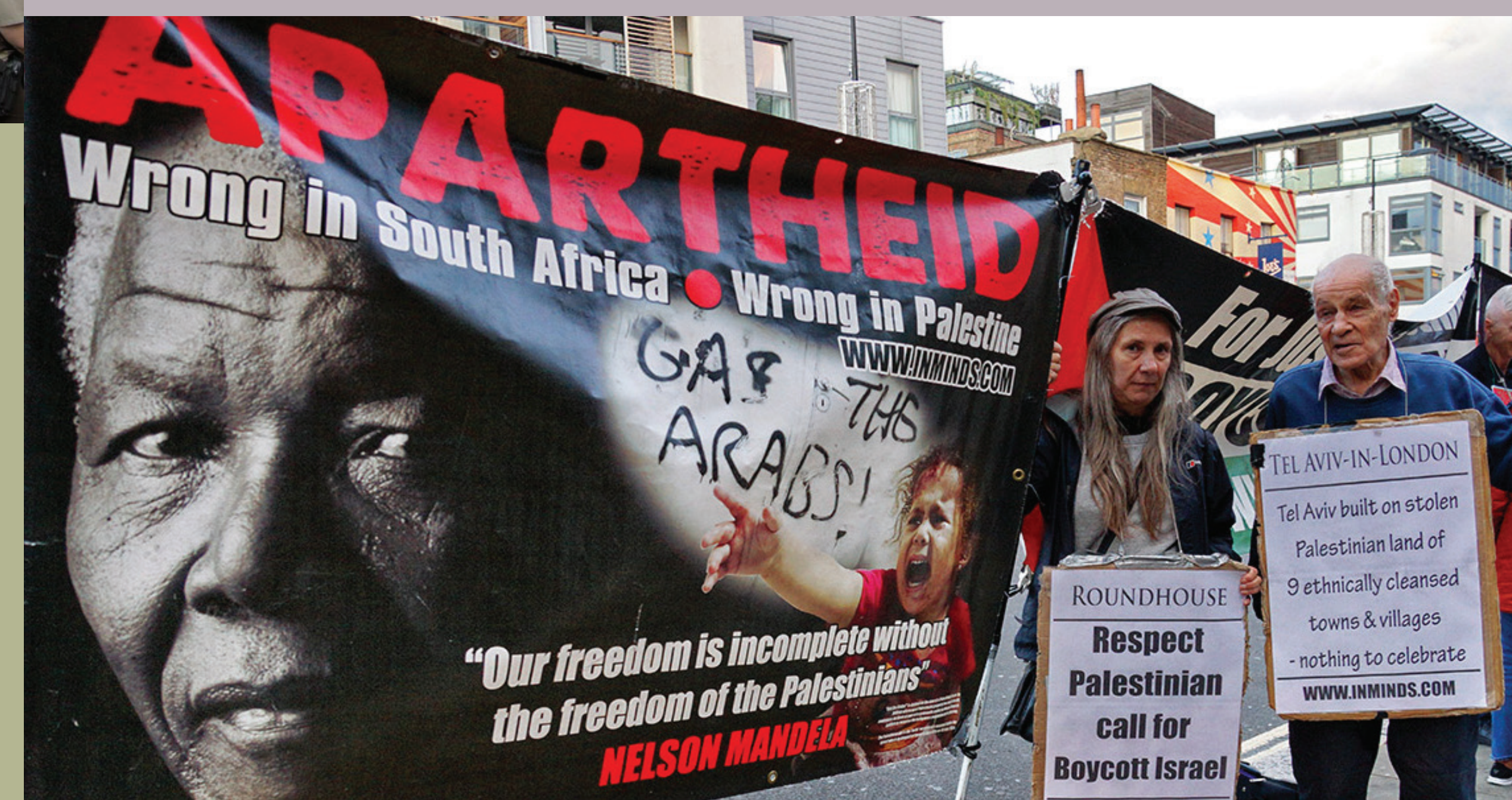
The London Protest Exposes Israeli Government "Brand Israel" propaganda in #TLVinLDN Festival, an example of a cultural boycott, September 2017.

Letter by Don Wagner, Presbyterian theologian and Palestine advocate, to fellow Palestine justice seekers, January 2017