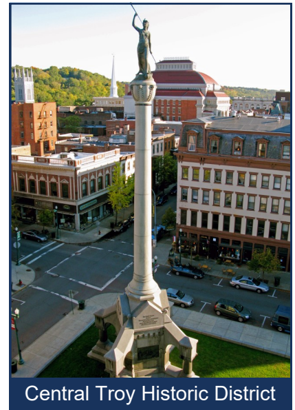
Central Troy Historic District

Once the district is listed, we will be happy to be involved in your celebrations! We can send a framed registers certificate or present it in person at a district listing ceremony depending on staff availability.