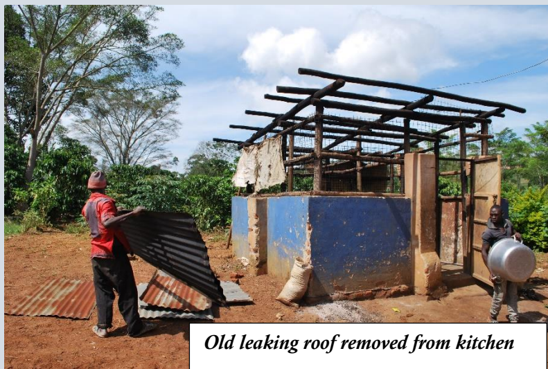
Old leaking roof removed from kitchen

The firewood was wet and needed to be dried-out, the cooking stove was also dump.