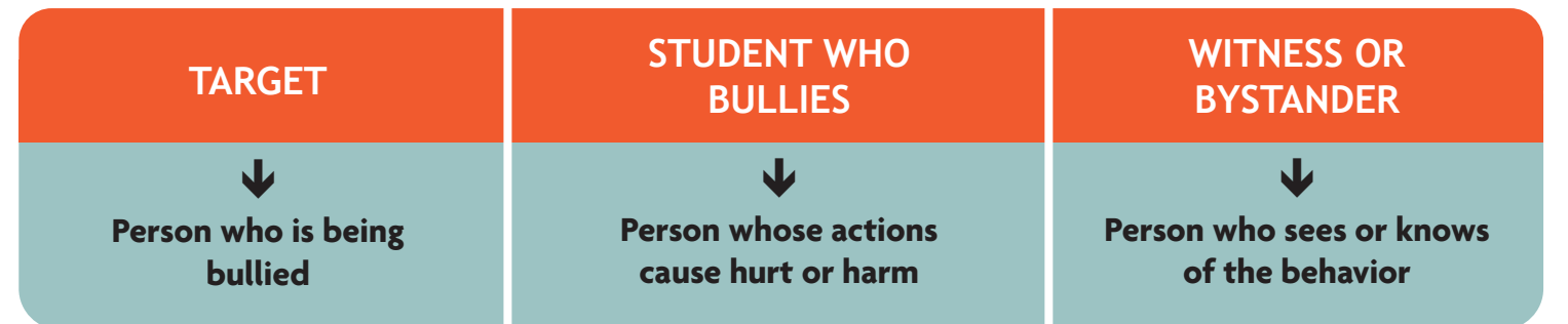
Note: "Person" may mean one individual or a group of people.