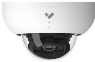
Camera System: $12,680