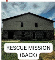
RESCUE MISSION (BACK)