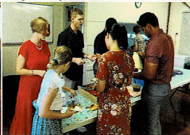
Fellowship lunch after church

Thank you for praying regarding the difficulties mentioned in our October prayer letter. Things have settled down a bit with that situation. Please continue to pray that we and the church do right and that the Lord will be glorified. Christmas brought many opportunities for service, fellowship and witness. Our carols night, children’s Christmas program, fellowship lunch and Christmas Day service were all well attended. We had visitors attend each of the services.