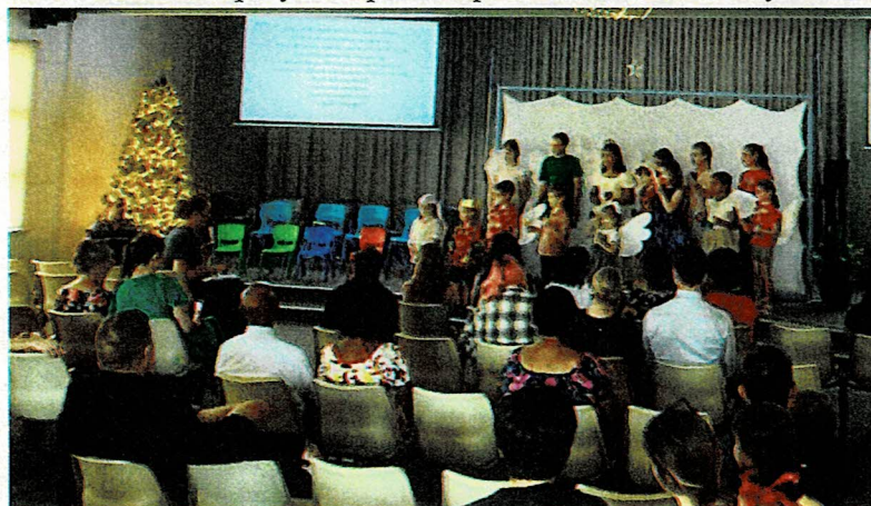
Children’s Christmas program

“Abide in me, and I in you. As the branch cannot bear fruit of itself, except it abide in the vine; no more can ye, except ye abide in me. — John 15:4. The last Sunday of 2025, I spoke briefly about the different sermons Jesus preached during His ministry and emphasized how important preaching was in His ministry. In John 15, Jesus was with His disciples and shared with them the importance of abiding in Him. Part of abiding in Christ is making God’s word and prayer important parts of our lives. May the Lord help us to do just that in 2026!