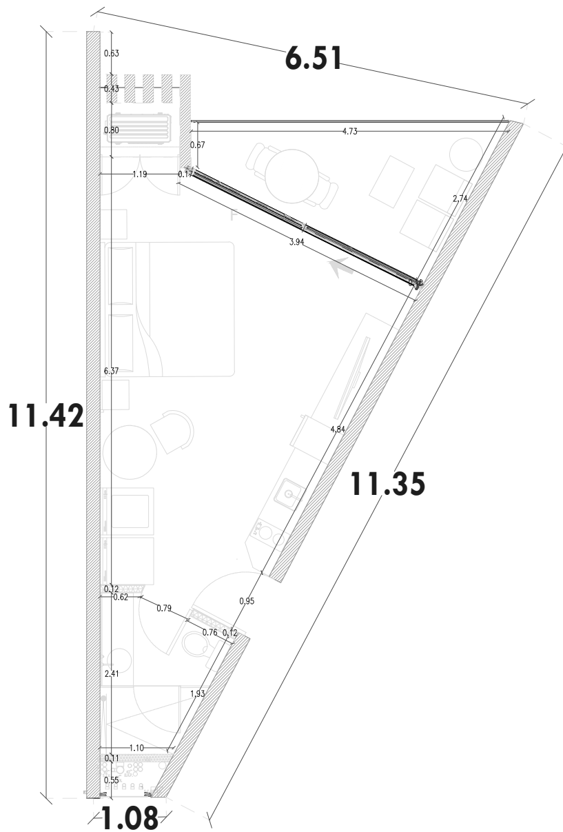
PLANTA BAJA (ACCESO POR P.B.)