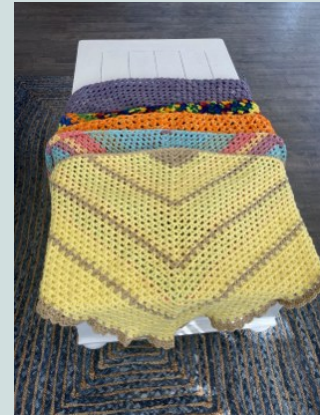
Above are some of the prayer shawls donated to St. Michael the Archangel Pregnancy Help Center.

We are so thankful to the Prayer Shawl Ministry. This ministry donates prayer shawls to our moms. The women who make these shawls pray for those who will receive them while they are making the shawls. Whether the prayer is offered with each stitch or each row—no doubt the good Lord hears the prayers for our moms offered by these beautiful and faith-filled women.