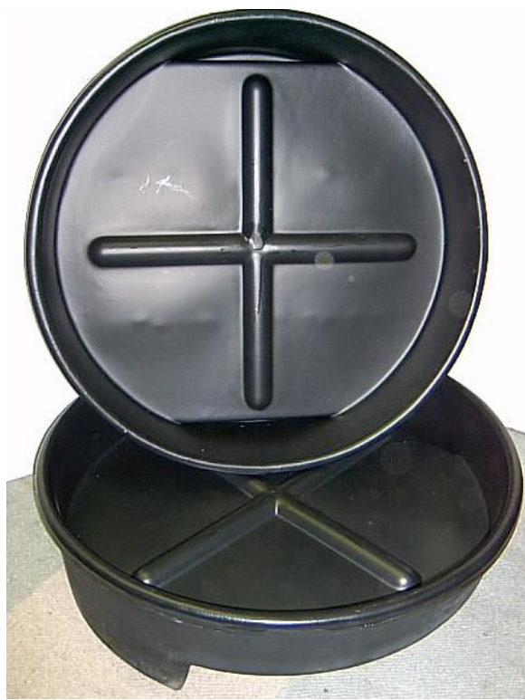
The nest is cross ribbed for extra strength and also has drainage points on two sides