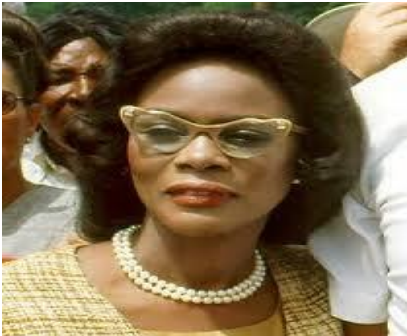
1978: Cicely Tyson as Coretta Scott King in the Mini series “King”.