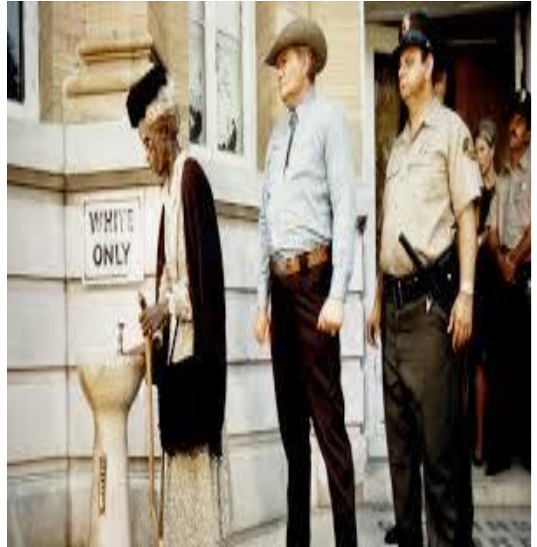
1974: The Autobiography of Miss Jane Pittman – Scene “At the Water Fountain”