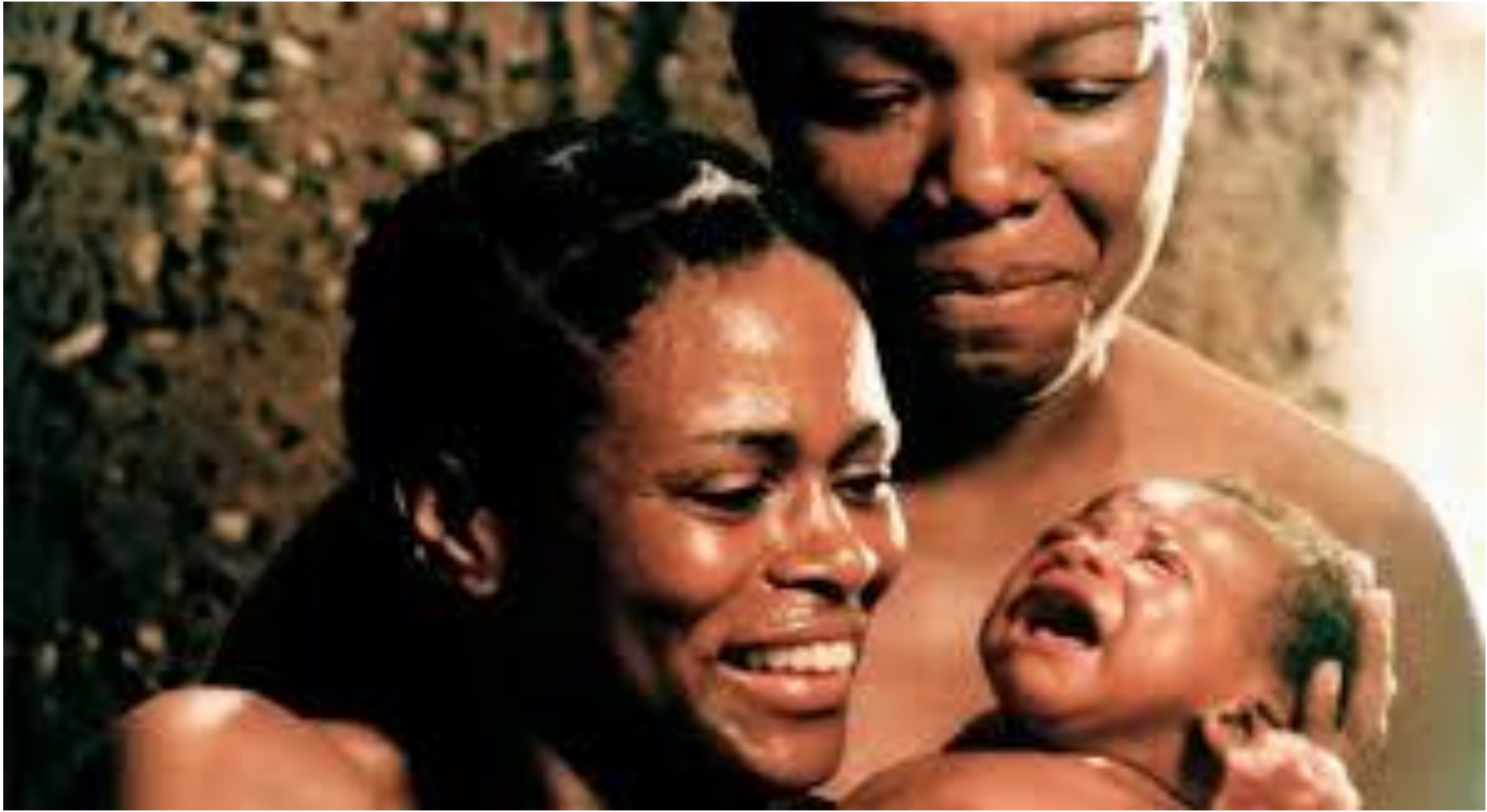
1977: Cicely Tyson as Binta, Kunte Kinte's Mom in "Roots The Mini Series".