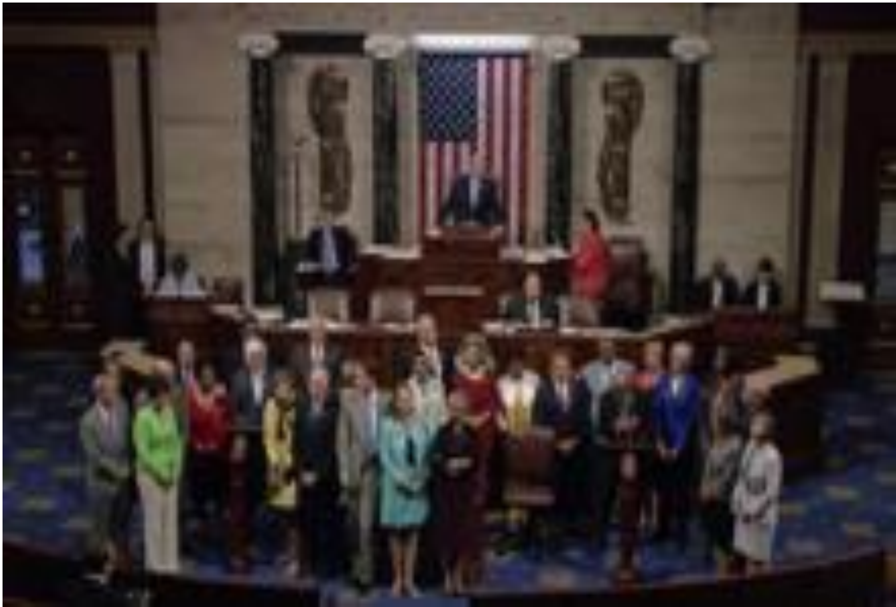
House Democrats, led by Lewis, take the floor to begin a sit-in demanding gun safety legislation on June 22, 2016