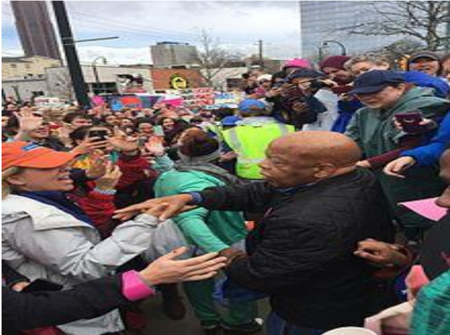
John Lewis at the 2017 Women's March in Atlanta