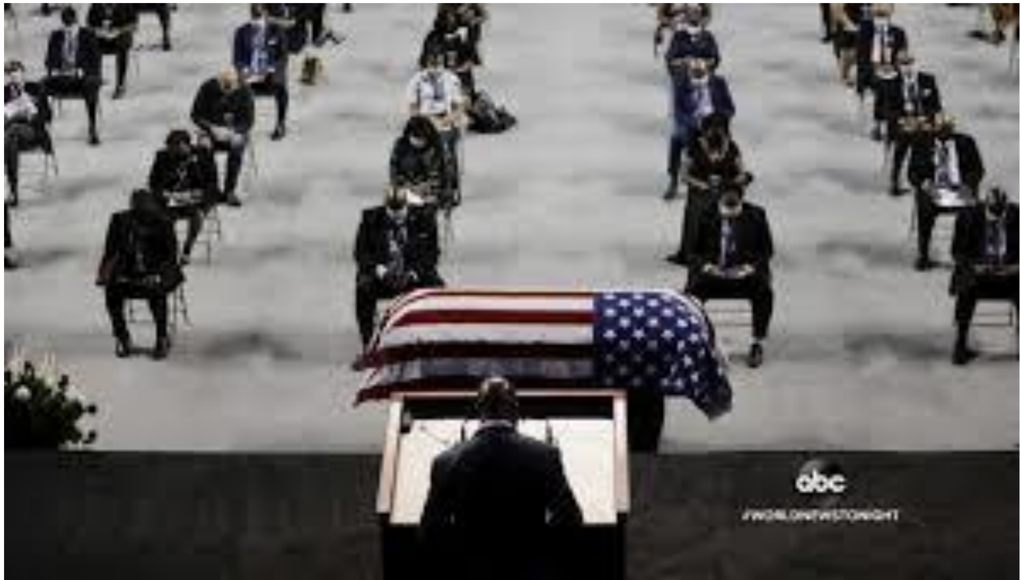
Senator John Lewis Funeral Titled: The Boy from Troy Funeral Services