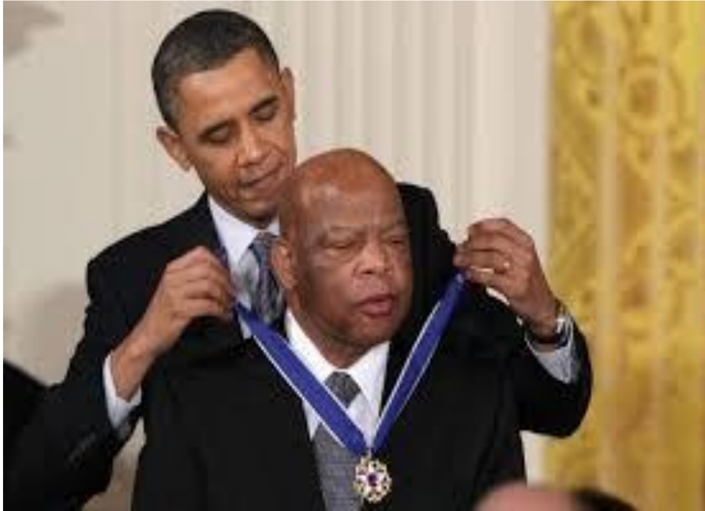
Receiving the Presidential Medal of Freedom - 2011