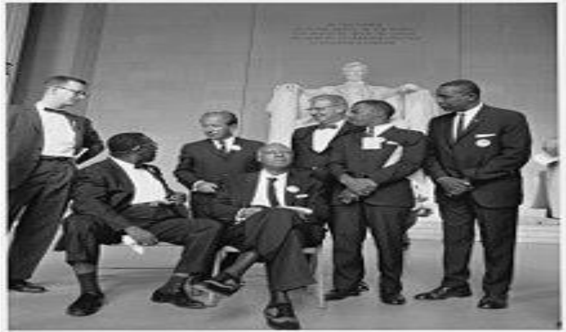
Leaders of the March on Washington, 1963. Lewis is second from right.