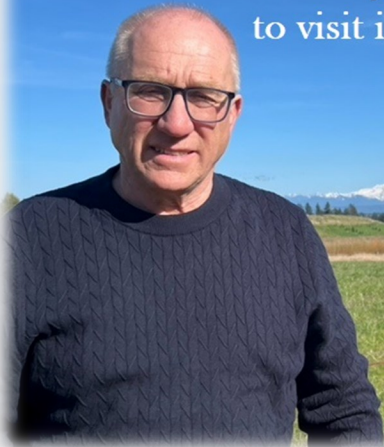
Finn Brobakken Snertingdal, Norway

Places you didn't know to visit in Norway