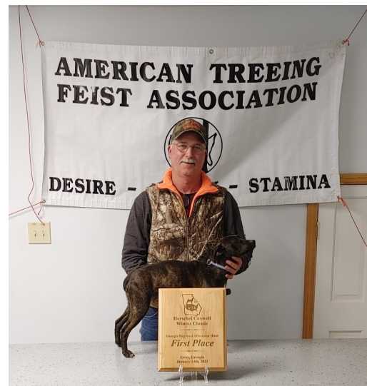
PM Winner: Coles' Banjo— right