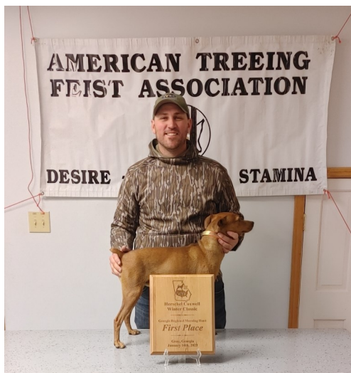
AM Winner: JBC's Scalded Copper—left