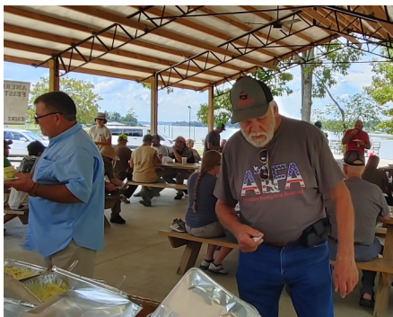
Summer Picnic 2022