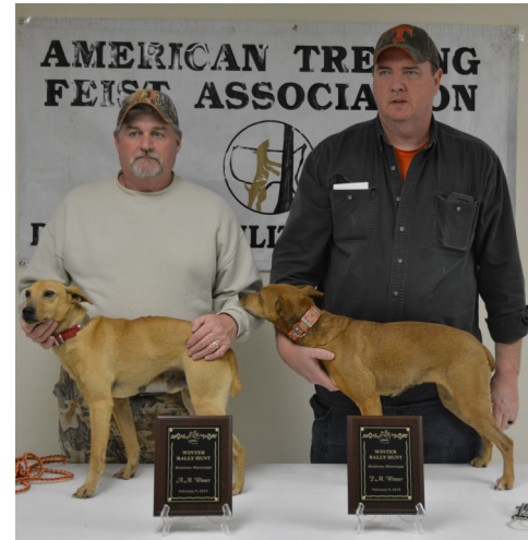
AM High Point Winner Reedy Creek Thunder PM High Point Winner Crossfire Squirrly