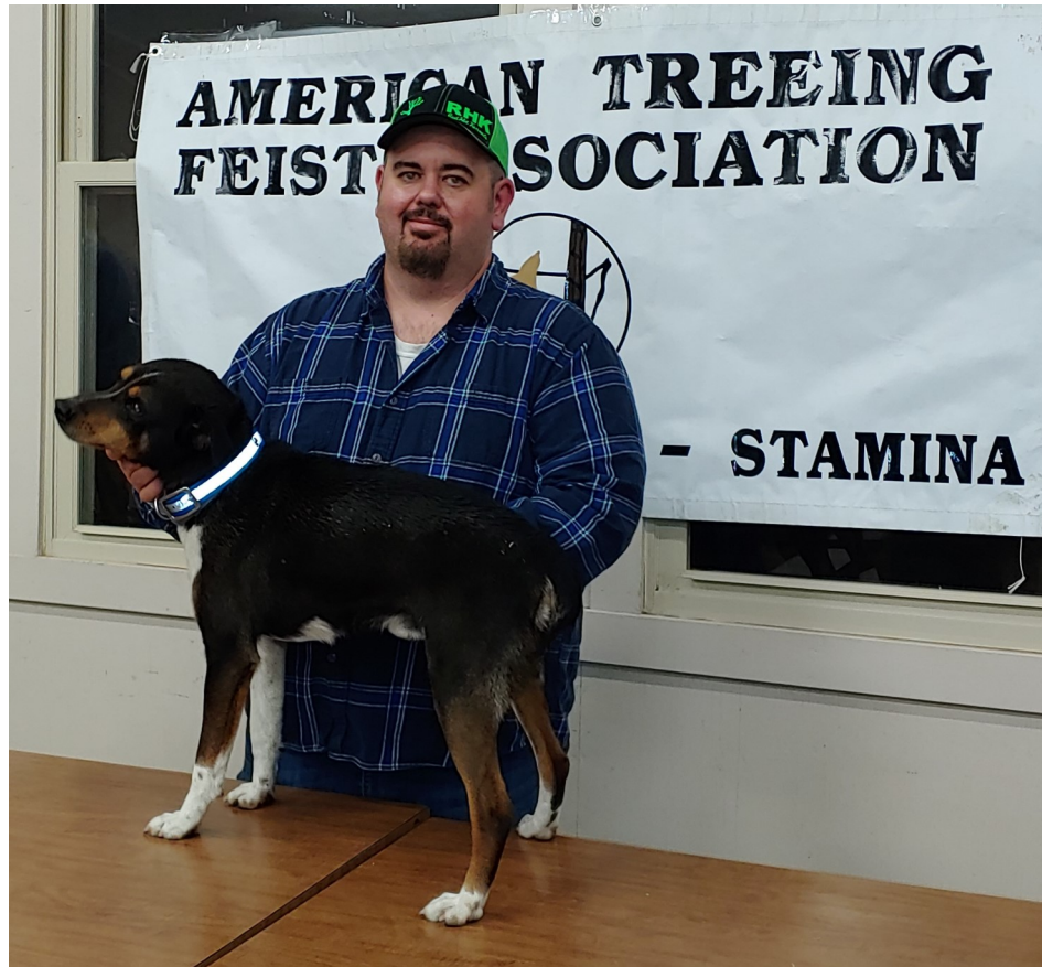
ATFA Dog of the Year 2019-2020 Red Hot Runt