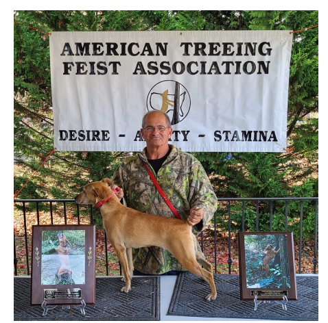
Crossfire Squirrly ATFA Gr Squirrel Champion

MERICAN TREEING FEISTASSOCIATION P.O. BOX 204832 MARTINEZ, GA 30917-4832