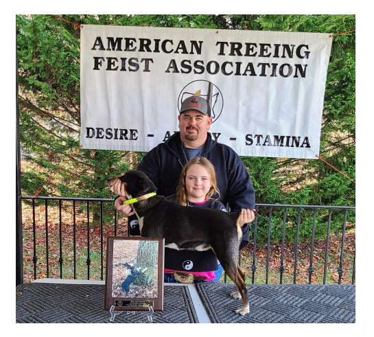
Red Hot Runt ATFA Squirrel Champion