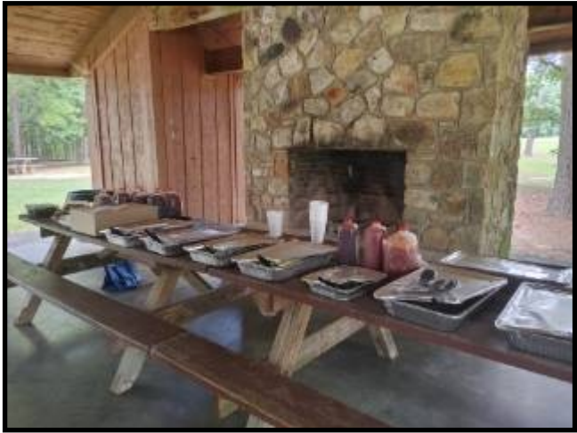
Summer Picnic 2021