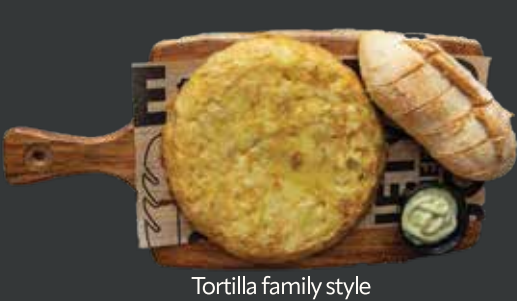
Tortilla family style

Tortilla family style ♦️ 🍴 $25'00 Served with gran reserva bread