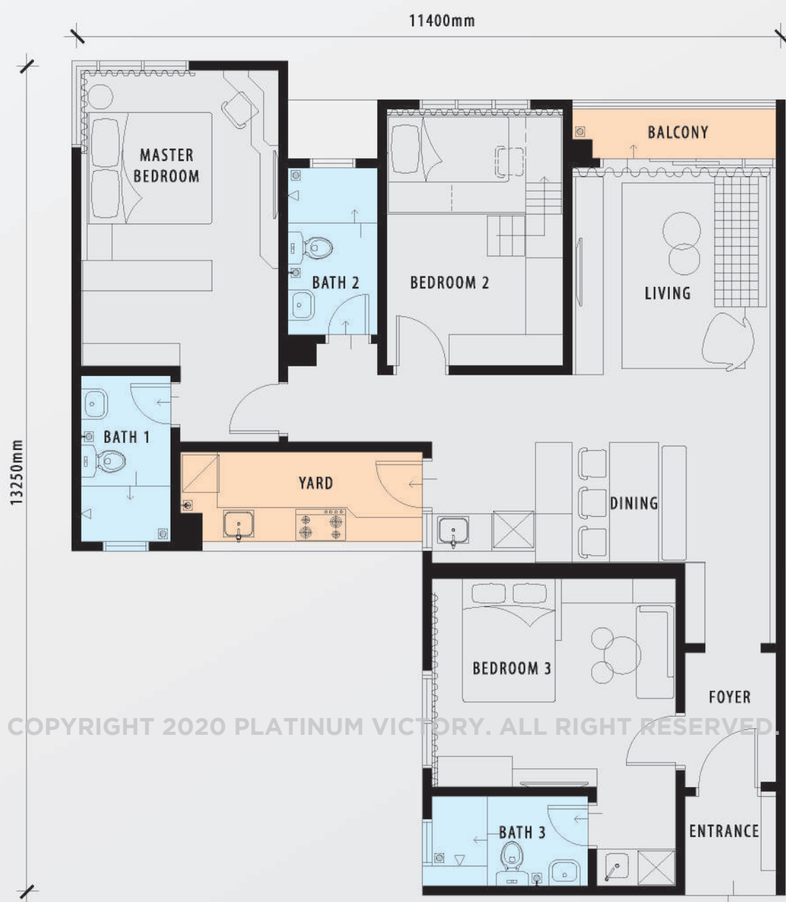
Type C 1,219 sq.ft.

Reside in well-designed living spaces that are the ideal setting to enjoy comfort at every moment.