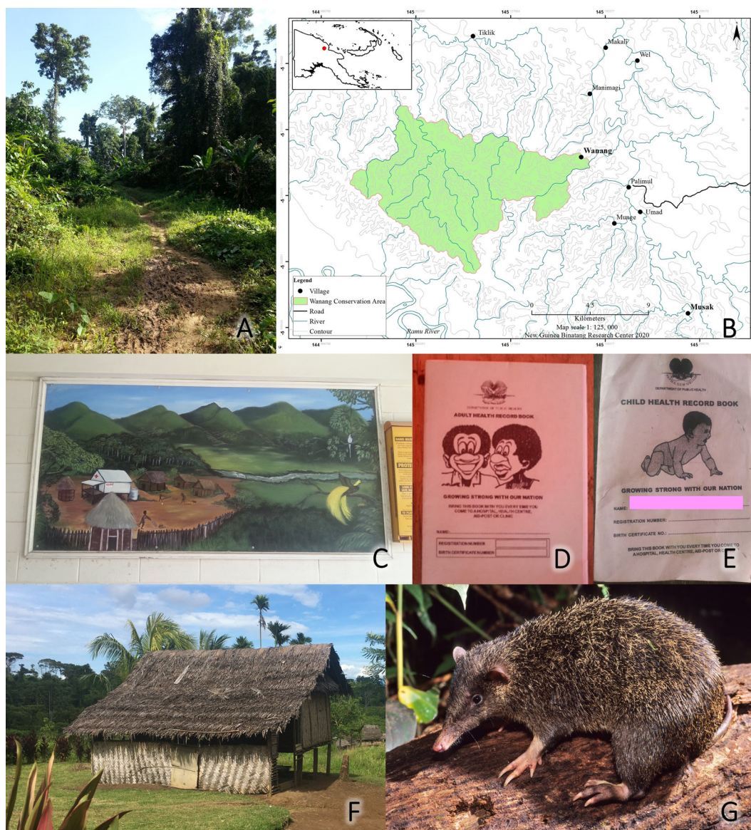
Figure 1 Study setting. (A) Overgrown logging road on the way to Wanang. (B) Wanang area. (C) Mural honouring the role of aid posts in PNG medicine on the wall of Madang Provincial Hospital. (D, E) Examples of individual health books in-use in-region at the time of this assessment. (F) Traditional house in Wanang village. (G) New Guinea common spiny bandicoot ( Echymipera kalubu ).

global commodity demands. 2,3 We report a health needs assessment carried out as our first step to simultaneously act on both these crises, by supporting a medically neglected community who are conserving their forest. Here, we outline site-specific context, biodiversity and health issues in PNG and our methodological rationale are discussed in detail in our published protocol. 4