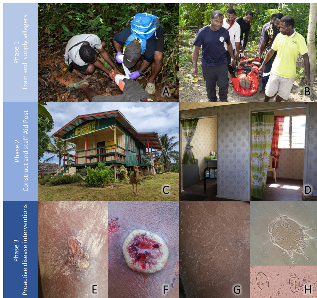
Figure 4 Phased health service introduction at Wanang. Examples of training provided: fracture management (A), off-road vacuum-stretcher evacuation (B). Wanang Aid Post, outside with a northern cassowary ( Casuarus unappendiculatus ) chick (C) and backrooms for nurse consultations (D). Examples of disease targets for proactive integrated interventions, tropical ulcer (E), yaws (F), tinea imbricata (G), scabies mite and eggs (H). Images from Madang Province in PNG (specifically: A, Baitabag; B, Nagada; C, D–F, H, Wanang) apart from Sarcoptes scabiei microscopy (H). Photographic consents were provided by individuals pictured.

‘not sure’ of what brings about cervical cancer. Though coughing and flushed skin were mentioned as signs of cancer, the main message was ‘we find out from the doctor’. A linked stated issue was that without primary care to assess community members and provide hospital referrals, subsequent therapy was thought likely to come too late. This was powerfully voiced by one KI whose mother had recently died of cervical cancer after protracted delayed diagnosis. Fear of medical interventions was also seen as a barrier to ‘cure’.