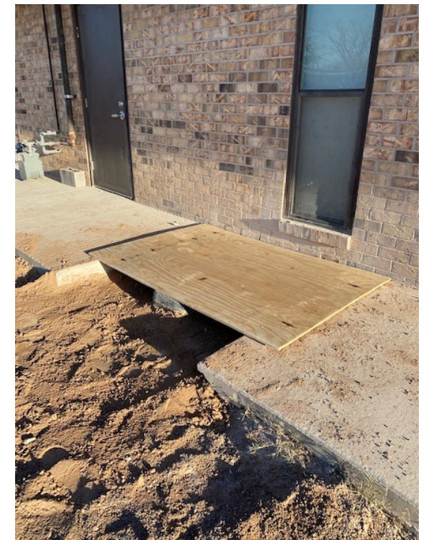
$ Breaking up the new sidewalk in search of the sewer clean out. $

A huge "Thank You" to those who have supported our church during the last three weeks we have been closed. There have been some plumbing issues. God has been gracious, but we may have extra expense to replace the cast iron pipes in the old building. Options are being determined now. Please remember that if you cannot attend, we still need to pay our utilities and staff. Your donations are the only source of revenue that we have. You can mail your donations to the church (we will provide pre-addressed envelopes if requested) or use the Tithe.ly app. Download the Tithe.ly app to your phone and fill out the profile. You may then donate to several funds as you choose.