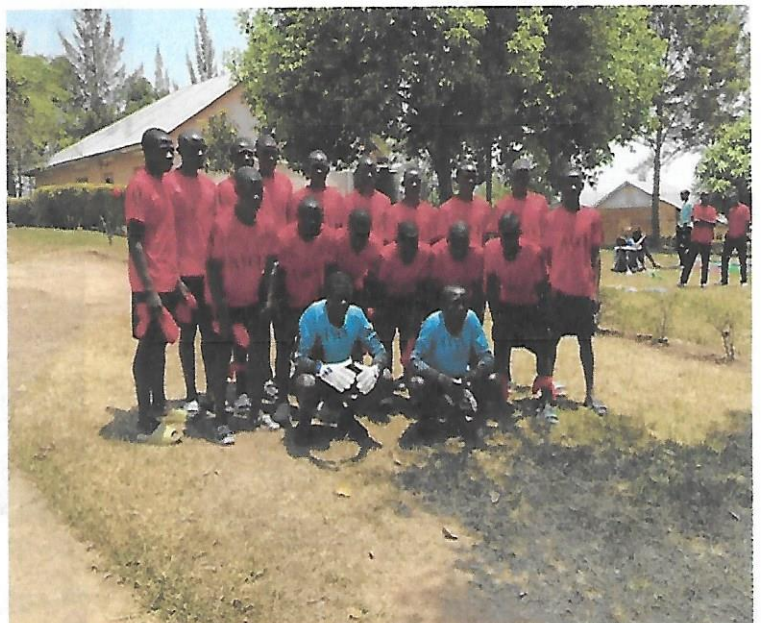
AWL Senior Football Team