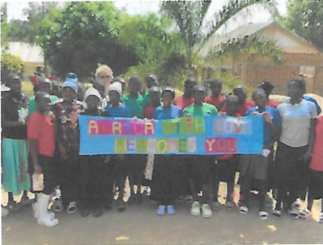
New Banner for the Health Centre