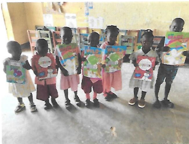
New books in the Nursery