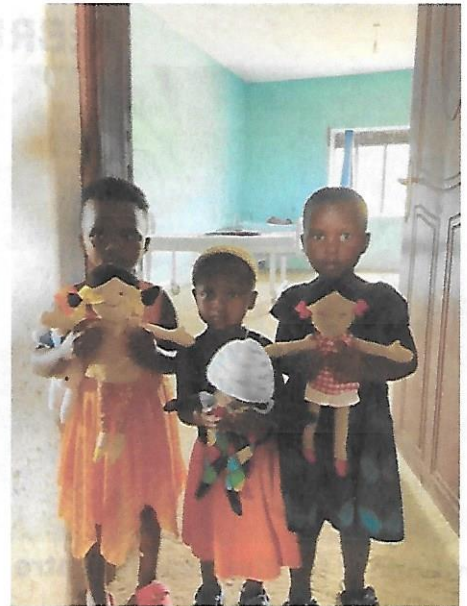
Teddies and Dolls