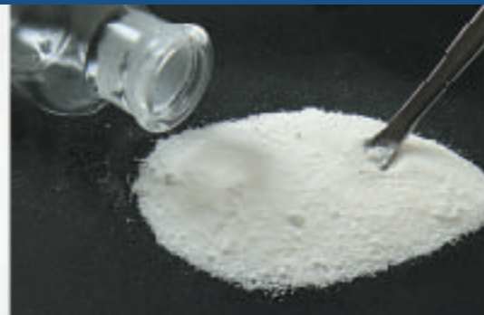
Sugars and Sweeteners