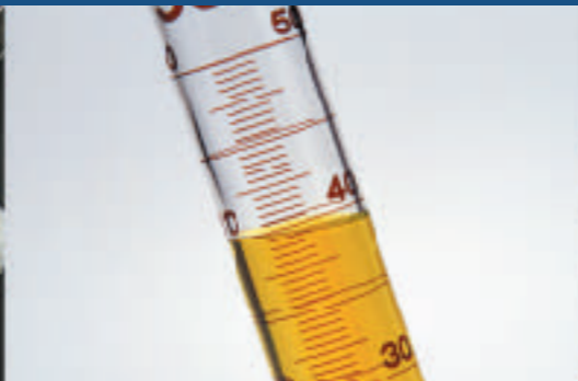
Essential oils, Flavors and Fragrances