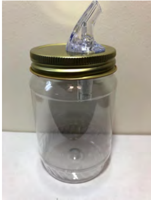
***PET, 16oz Jar