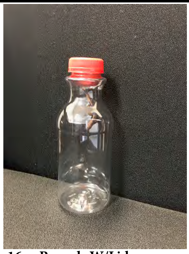
16oz Rounds W/Lids