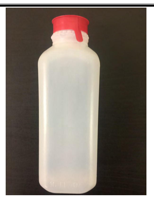
16oz Square w/ Lids