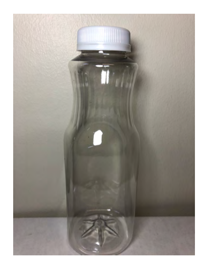
Carafe Juice Bottles W/Lids 12oz & 16oz