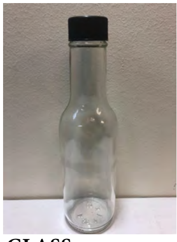
GLASS 50z Hot Sauce Bottle Includes Red Or Black Lid Includes Orifice Reducer