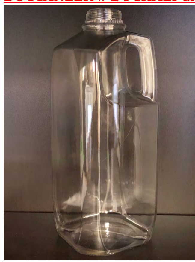
BOX PACK-54 PER CASE