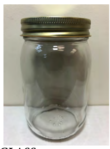
GLASS 16oz Plain Mason Jar Includes Metal or White Poly Lids