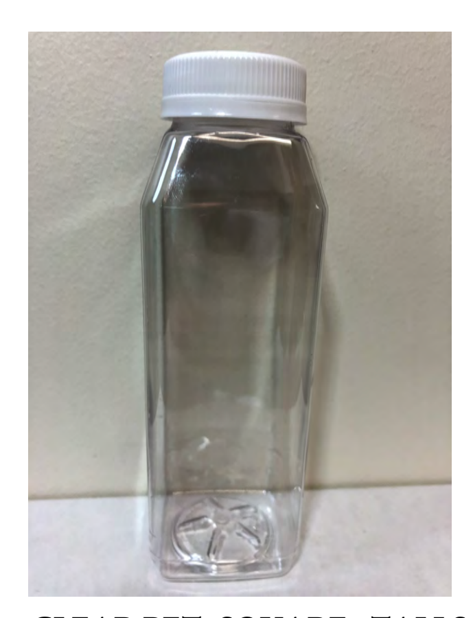
CLEAR PET, SQUARE, TALLS