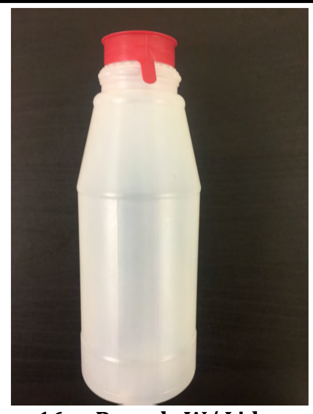
16oz Rounds W/ Lids HDPE Natural