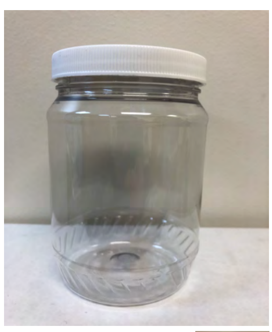
***Includes Tamper-Resistant Foam Security Liner