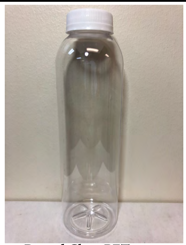
Round Clear PET