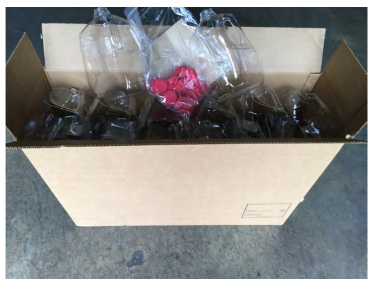
BOX PACK-24 PER CASE