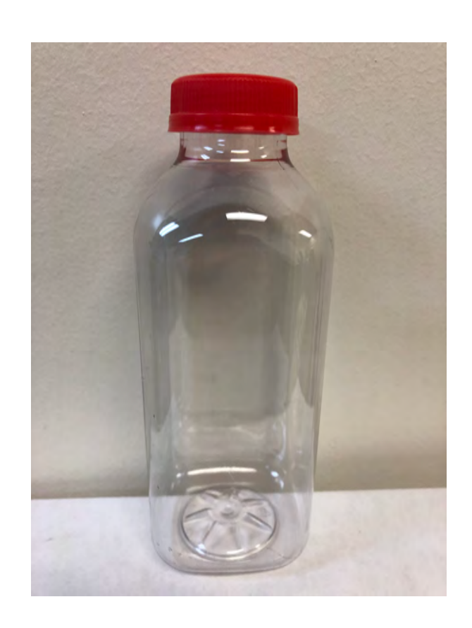
CLEAR PET, SQUARE

20z, 40z, 80z, 10oz, 12oz & 16oz w/ Lids