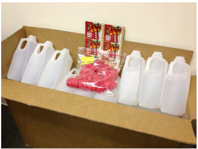
BOX PACK-54 PER CASE