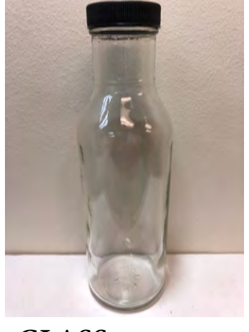
GLASS 12oz Sauce Bottle Includes Lids