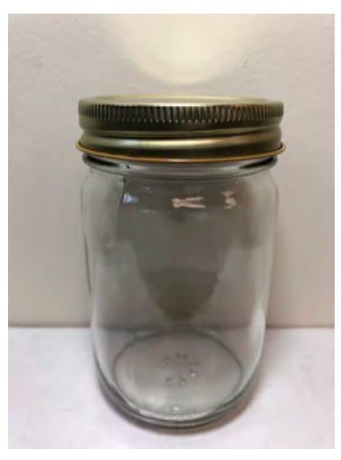
GLASS 16oz Plain Mason Jar Includes Metal or White Poly Lids