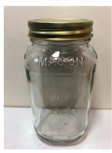
GLASS 26oz Plain Mason Jar Includes Metal or White Poly Lids