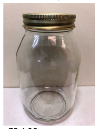
GLASS 32oz Plain Mason Jar Includes Metal Lids or White Poly Lids