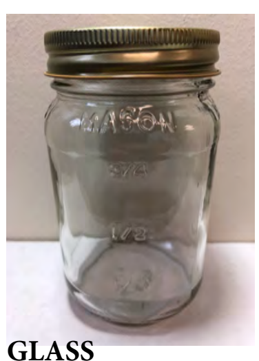
16oz Plain Mason Jar, Includes Metal or White Poly Lids