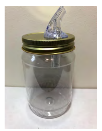
***PET, 16oz Jar