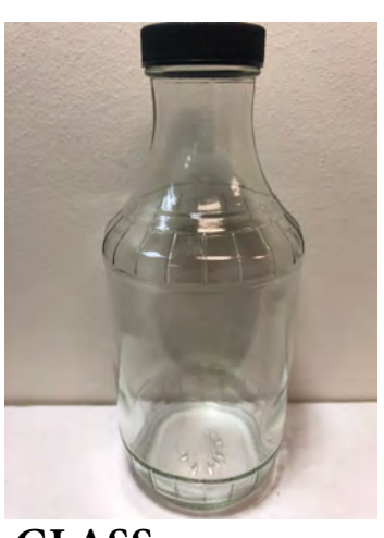
GLASS 17oz Sauce Bottle Includes Lids