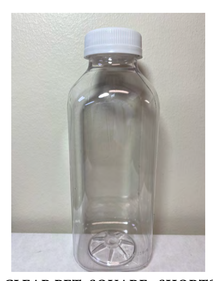
CLEAR PET, SQUARE, SHORTS

20z, 40z, 80z, 10oz, 12oz, 16oz, 32oz w/ Lids