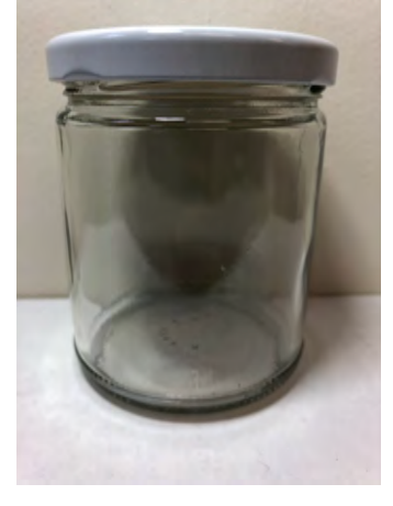
GLASS 9oz Open Top Jar Includes Lids