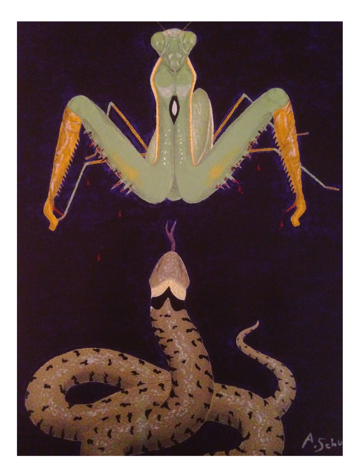
Erotic scene with praying mantis: "L' ultime prédateur "by Alexandre Schuck Figure: Gallery 102 / A. Schuck