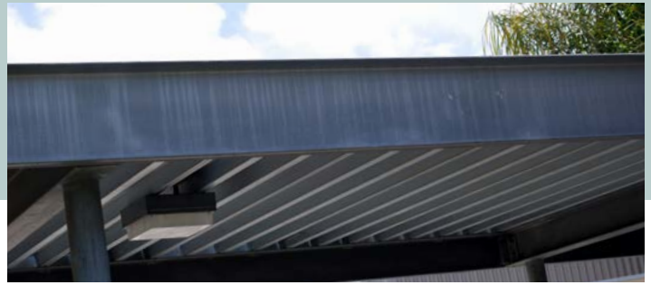
After: June 2009