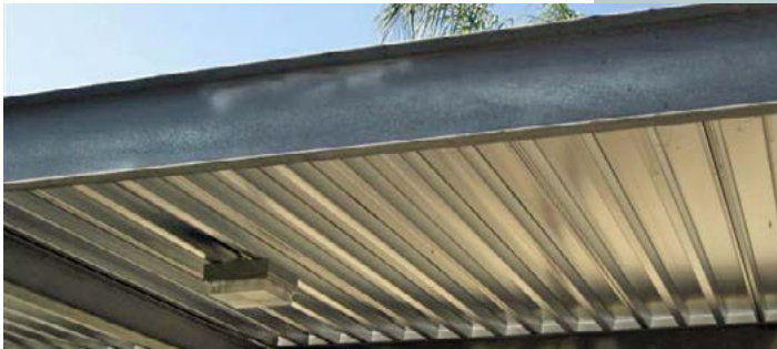
Before: October 2006