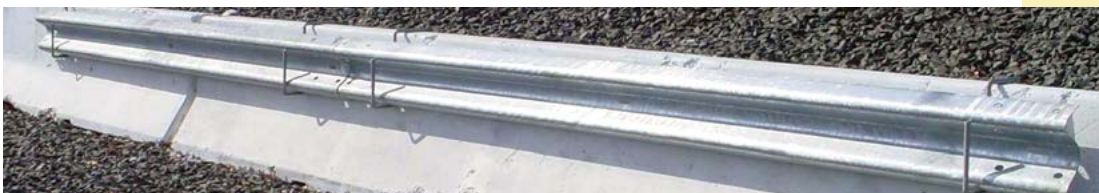
After natural weathering: Consistent appearances