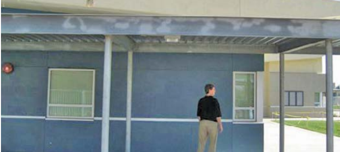
Before: October 2006

A great example of this transformation is the canopied walkway at Mark Twain Elementary in Riverside, CA. The galvanized canopies were installed in October of 2006, and the initial coating appearance varied (see before photos) from bright and shiny to matte gray on the same beam. In June of 2009, the structure was revisited to examine the appearance and performance. The beams are now all uniformly matte gray with little to no visible difference in appearance. Additionally, as hot-dip galvanizing provides 75 years or more of maintenance-free corrosion protection, the beams show no signs of rust staining or corrosion damage.