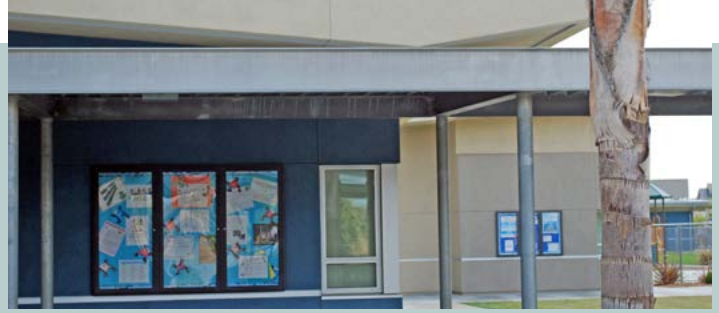
After: June 2009