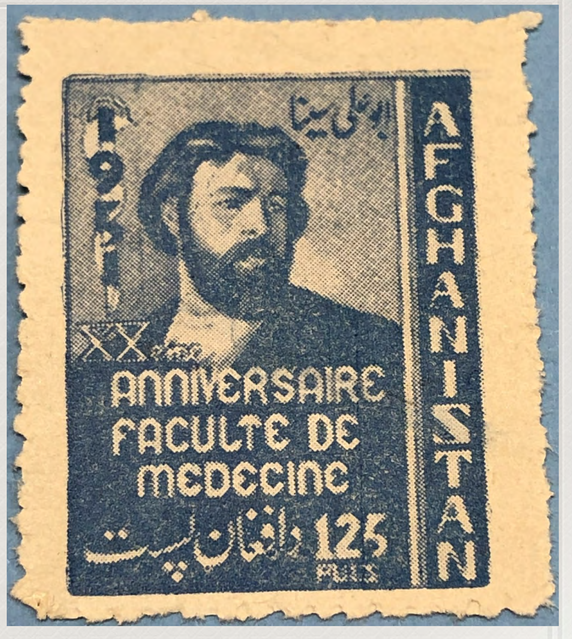
Afghanistan 1951, celebrating the 20<sup>th</sup> anniversary of the national Graduate School of Medicine Scott 390-1