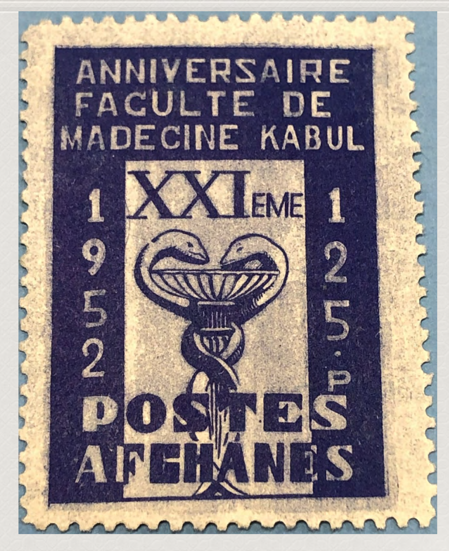
Afghanistan 1952, celebrating the 21st anniversary of the national Graduate School of Medicine Scott 403-4