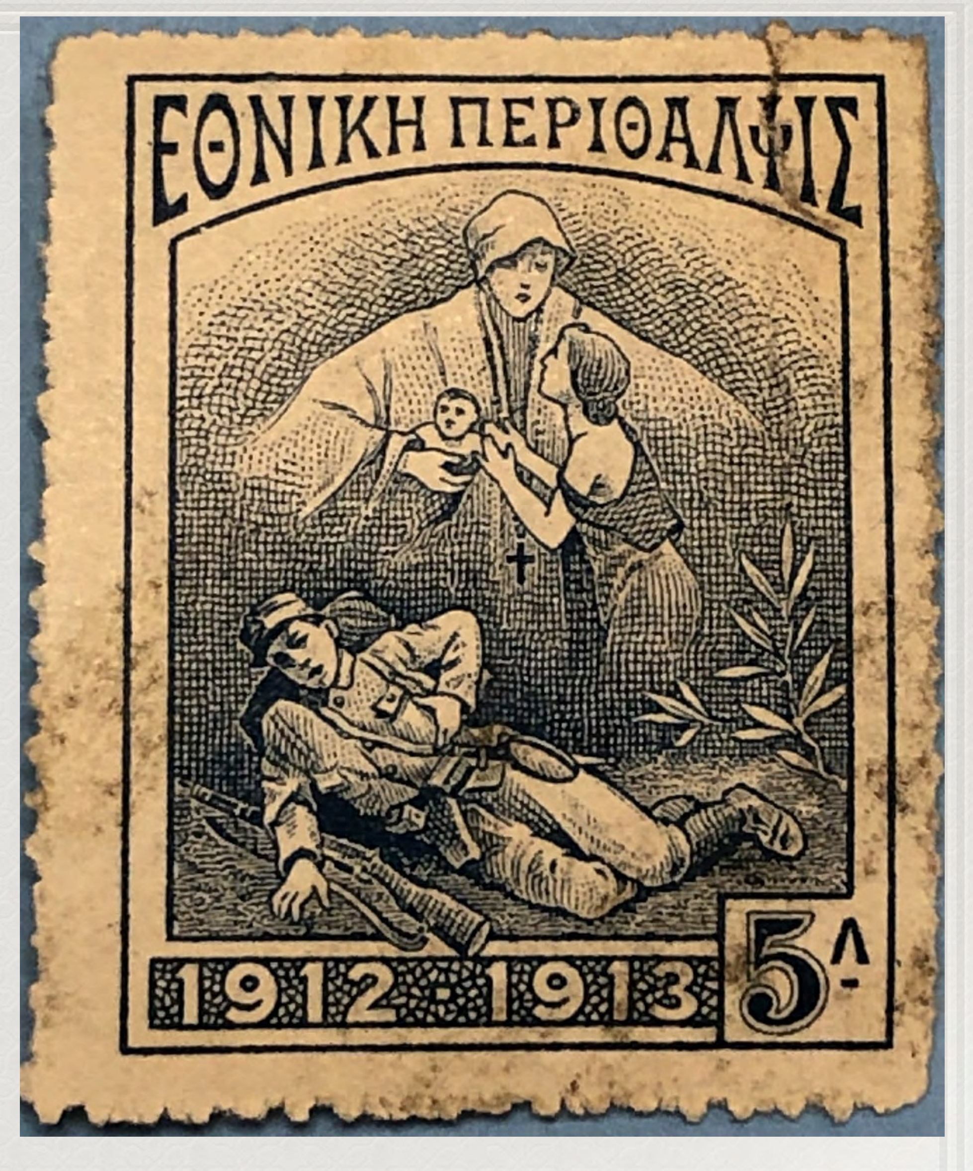
Greece Postal Tax 1914, "The Tragedy of War"