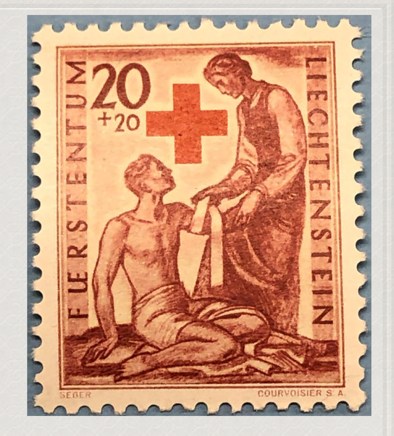
Liechtenstein 1945, Semi-Postal "Protect the Child" Scott B15