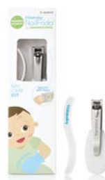
Nailfrida The Snipperclipper Set Includes: 1 Nailfrida SnipperClipper, 1 S-Shaped Baby File UPC: 851877006011 MSRP: $12.99 Qty Per Unit 1 | Case Pack 6