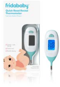
Rectal Thermometer UPC: 810028770089 MSRP: $14.99 Qty Per Unit 1 | Case Pack 4