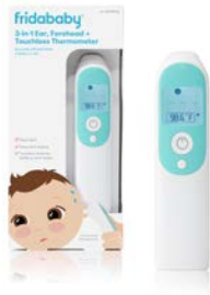
Infrared Thermometer UPC: 810028770614 MSRP: $4.99 Qty Per Unit 1 | Case Pack 3