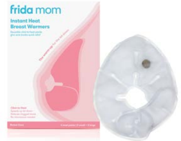
Instant Heat Packs UPC: 810028770546 MSRP: $10.50 Qty Per Unit 4 | Case Pack 4