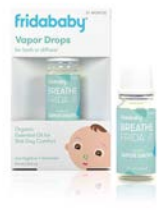
Breathefrida Vapor Drops UPC: 851877006455 MSRP: $9.99 Qty Per Unit 1 | Case Pack 4