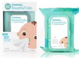
BreatheFrída Nose-Chest Wipes (30ct) UPC: 851877006219 MSRP $4.99 Qty Per Unit 30 | Case Pack 4