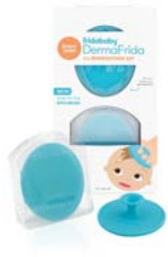
Dermafrida The Skinsoothe 2pk UPC: 851877006196 MSRP: $10.99 Qty Per Unit 2 | Case Pack 4