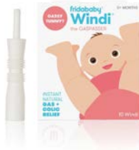
Windi The Gaspasser UPC: 85877006387 MSRP $12.99 Qty Per Unit 10 | Case Pack 6