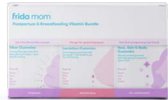
Gummy Starter Kit *COMING SOON UPC: 810028770577 MSRP: $28.00 Qty Per Unit 1 | Case Pack 3

For more information or to place an order, email carolinababyco@aol.com or call 864-882-3183