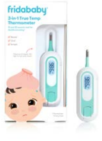
3-in-1 Thermometer UPC: 810028770089 MSRP: $19.99 Qty Per Unit 1 | Case Pack 4