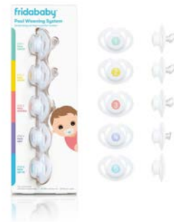
Pacii Weaning System UPC: 810028770010 MSRP $19.99 Qty Per Unit 5 | Case Pack 4

For more information or to place an order, email carolinababyco@aol.com or call 864-882-3183