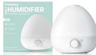
Breathefrída The Humidifier UPC: 851877006431 MSRP $49.99 Qty Per Unit 1 | Case Pack 4