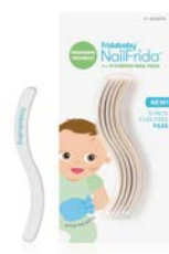
S-Curved Nail Files (5pack) UPC: 851877006189 MSRP: $5.99 Qty Per Unit 5 | Case Pack 6