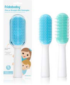
Toddler Hair Detangler UPC: 810028770065 UPC: 810028770072 MSRP: $9.99 Qty Per Unit 1 | Case Pack 4