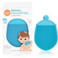
Dermafrida Bath Mitt UPC: 851877006479 MSRP: $10.99 Qty Per Unit 1 | Case Pack 3