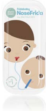
Nosefrida Travel Case *Exclusive To Boutiques UPC: 851877006059 MSRP $17.99 Qty Per Unit 1 | Case Pack 5