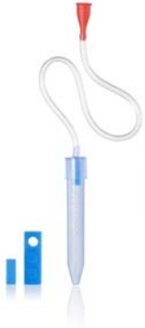
Nosefrida The Snotsucker Nasal Aspirator UPC: 851877006134 MSRP $15.99 Qty Per Unit 1 | Case Pack 6