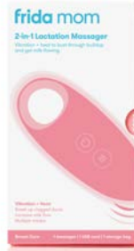
2-in-1 Heat and Vibration Lactation massager * COMING SOON UPC: 810028770539 MSRP: $29.99 Qty Per Unit 1 | Case Pack 3