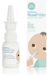
Nosefrida Saline Snót Spray UPC: 851877006042 MSRP $5.99 Qty Per Unit 1 | Case Pack 6