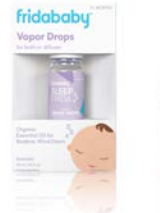
Sleepfrida Lavender Vapor Drops UPC: 810028770324 MSRP: $9.99 Qty Per Unit 1 | Case Pack 4