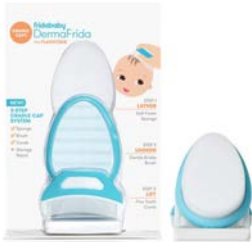
Dermafrida Flake Fixer UPC: 851877006509 MSRP: $14.99 Qty Per Unit 1 | Case Pack 4