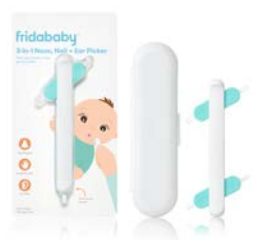
3-in-1 Nose, Nail + Ear Picker UPC: 810028770027 MSRP: $9.99 Qty Per Unit 1 | Case Pack 4

For more information or to place an order, email carolinababyco@aol.com or call 864-882-3183