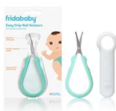
Infant Nail Scissors UPC: 851877006981 MSRP: $7.99 Qty Per Unit 1 | Case Pack 4