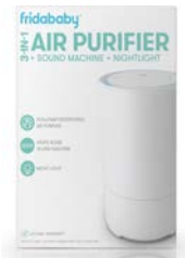
3-in-1 Air Purifier UPC: 810028770584 MSRP $79.99 Qty Per Unit 1 | Case Pack 4

For more information or to place an order, email carolinababyco@aol.com or call 864-882-3183