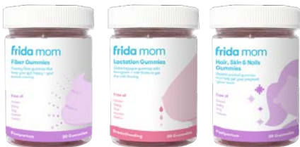
Vitamin Gummies Fiber - 810028770867 * COMING SOON Lactation - 810028770737 Hair + Skin - 810028770850 * COMING SOON MSRP: $19.99 Qty Per Unit 1 | Case Pack 3