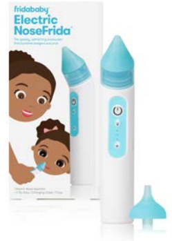
Electric Nasal Aspirator UPC: 810028770591 MSRP $39.99 Qty Per Unit 1 | Case Pack 3