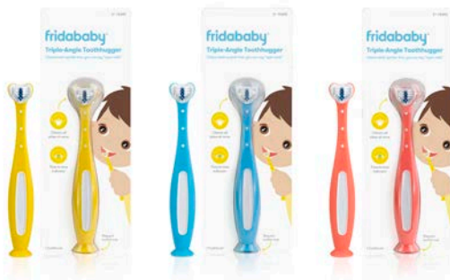
Smilefrida The Toothhugger 2.0 *NEW DESIGN & UPCs Yellow - 810028770164 Blue - 810028770171 Pink - 810028770195 MSRP $7.99 Qty Per Unit 1 | Case Pack 6