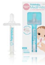
Medifrida The Accu-Doser UPC: 851877006110 MSRP $12.99 Qty Per Unit 1 | Case Pack 4