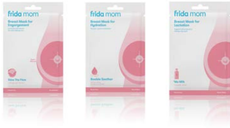
Breast Sheet Masks Reduce - 810028770553 Increase - 810028770560 Skin Care - 810028770621 MSRP: $6.99 Qty Per Unit 2 | Case Pack 6