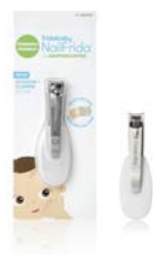
Nailfrida The Snipperclipper Solo UPC: 851877006103 MSRP: $7.99 Qty Per Unit 1 | Case Pack 3