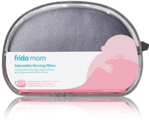
Adjustable Nursing Pillow UPC: 810028770522 MSRP $49.99 Qty Per Unit 1 | Case Pack 4