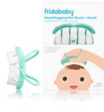
Infant Hairbrush + Comb + Case UPC: 810028770027 MSRP: $9.99 Qty Per Unit 1 | Case Pack 4